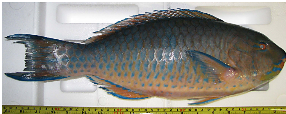
Fig. 1: The specimen of Scarus ghobban from Zygi, Cyprus (Photo: G. Ioannou).