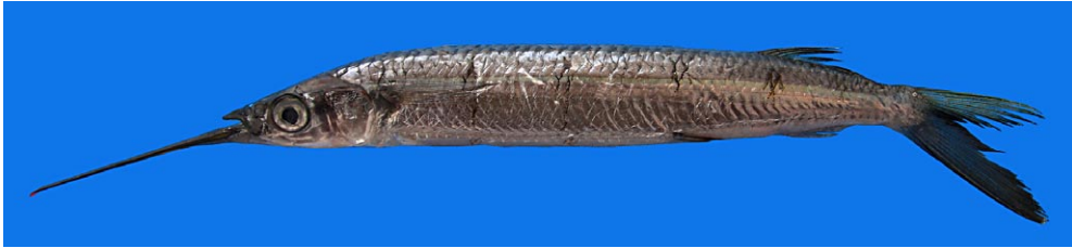
Fig. 1: Hemiramphus far (Forsskål, 1775) specimen (14.6 cm in SL), captured off Eski Foça (Northern Aegean Sea).