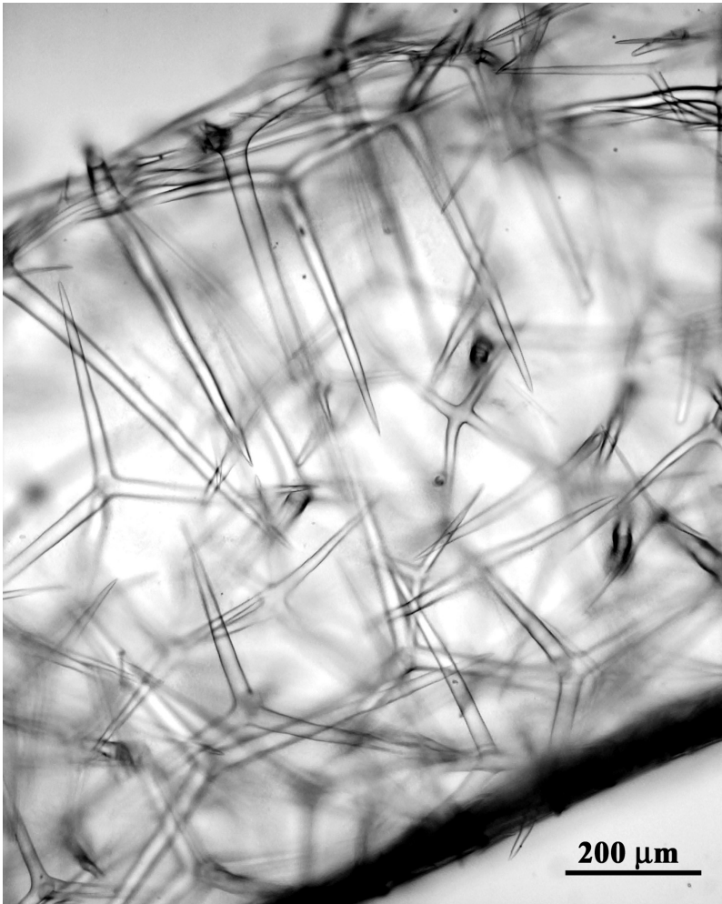
Fig. 2: Cross section of Paraleucilla magna from Marsaxlokk Bay, Malta, showing the skeletal architecture. (Image: C. Longo).

LONGO et al. (2007) considered Paraleucilla magna to be an alien species in the Mediterranean and suggested that bivalve aquaculture and shipping were the most probable vectors responsible for its spread. The reasons given by these authors were that (i) the genus Paraleucilla had never been recorded before in the Mediterranean Sea and that its distribution encompassed the Indo-Pacific and Red Sea; (ii) all the