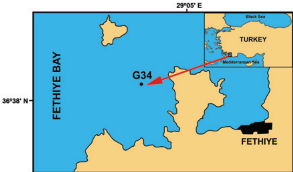
Fig. 1: Map of sampling area.