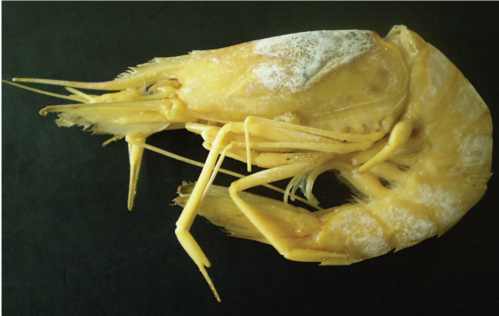
Fig. 2: Lateral view of Aristeus antennatus (Risso, 1816) (♀, CL= 53 mm) collected off the Marmaris coast (southern Aegean Sea).