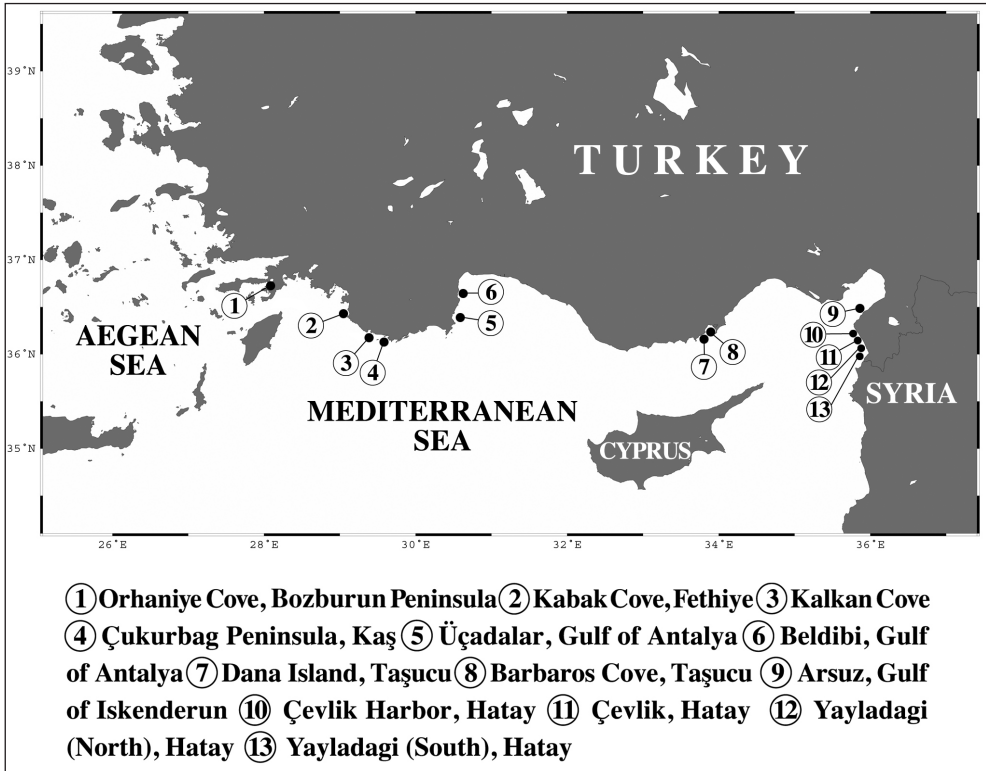
Fig. 2: Map showing the collection sites of Ergalatax junionae .