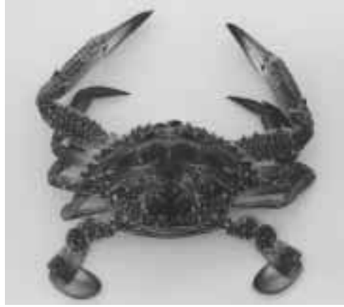
Fig. 2: A live female of Portunus pelagicus , dorsal view (Carapace width: 170.7 mm).

Four specimens as follows: 1 spm, 87.5 TL, 75mm SL, 18g, 1 spm, 80.1mm TL, 67.1 SL, 11.5g, 1 spm, 96mm TL, 80mm SL, 25g, 1 spm, 84mm TL, 76mm SL, 13g. Morphometric characters were measured on two specimens (Table 2).