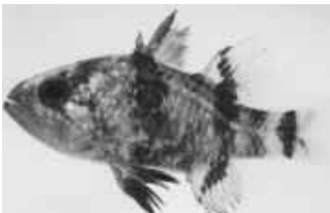
Fig. 3: A live specimen of Apogon pharaonis (80 mm SL).

Three specimens, maintained in the Aquarium of the Hydrobiological Station of Rhodes, are carnivorous (mussels, shrimps, squids) and hardy. Being a nocturnal species (TORTONESE, 1986), it prefers to retreat and hide in small caves, under the rocks and in empty shells.