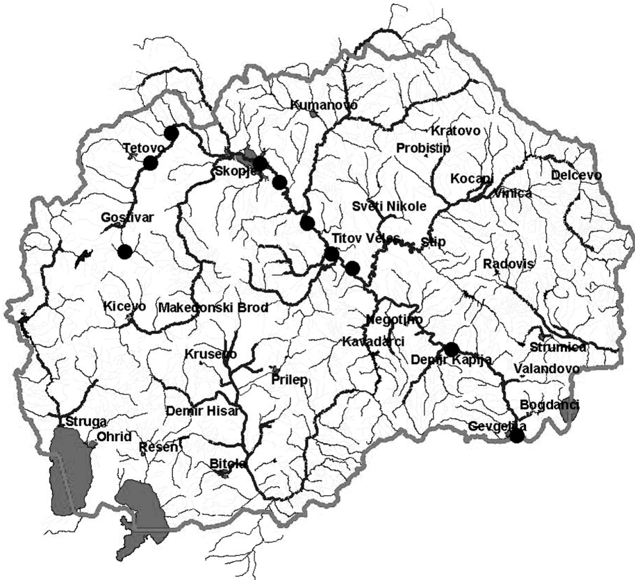
Fig. 1: River Vardar water course in FYR Macedonia and 10 sampling sites.

obtaining the initial data of heavy metal load in the river bed on the sampling sites.