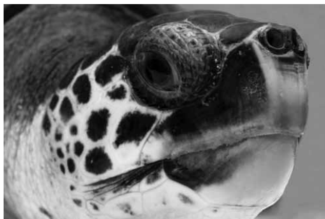
Fig. 2: Detail of the shape and coloration of the head.