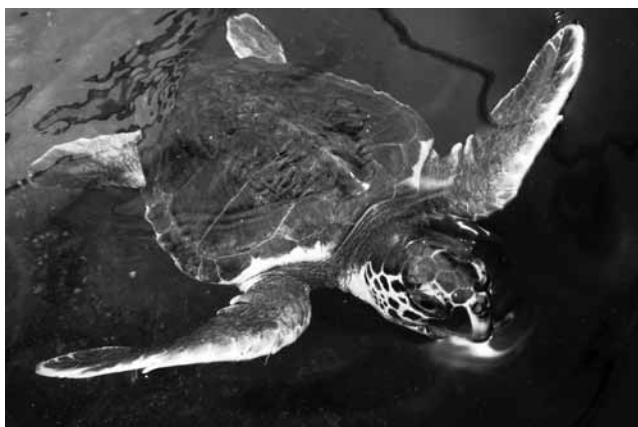
Fig. 1: Picture of Matilde in the rescue center “Centro Regionale Recupero Fauna Selvatica e Tartarughe Marine” (Comiso, Ragusa).