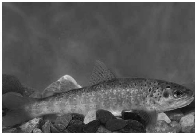
Fig. 3: Unidentified trout specimen, Salmo sp., collected at Gorgopotamos, Sperchios Basin.