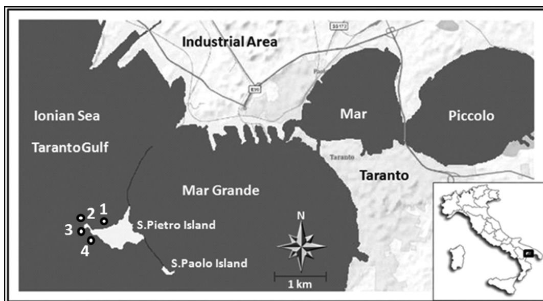
Fig. 1: Location of the sampling stations.

Mercury concentrations were determined with an Advanced Mercury Analyser (AMA-254, LECO, Stockport, Cheshire, UK), which allows a direct analysis without sample extraction procedure. The instrument consists of a nickel boat in a quartz combustion tube, containing a catalyst (cobalt oxalate and a mixture of manganese oxide, cobalt and calcium acetate) in which the solid sample (about 100mg of dried sample: sediments or plants) is initially dried prior to combustion at 750°C in an oxygen atmosphere. The mercury vapour which is produced is trapped on the surface of a gold amalgamator. After a specified time interval, the amalgamator is heated to 900°C, to release