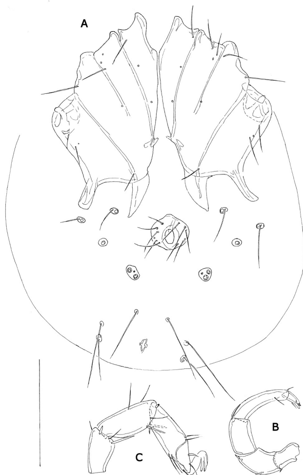
Fig. 3: Pontarachna valkanovi Petrova, 1978, male: A = idiosoma, ventral view; B = palp; C = fourth to sixth segments of leg I. Scale bars = 100 µm.

nop bay: Pontarachna valkanovi were collected from 3 m depth, while P. adriatica seems to be characteristic of deeper waters (10 m depth).