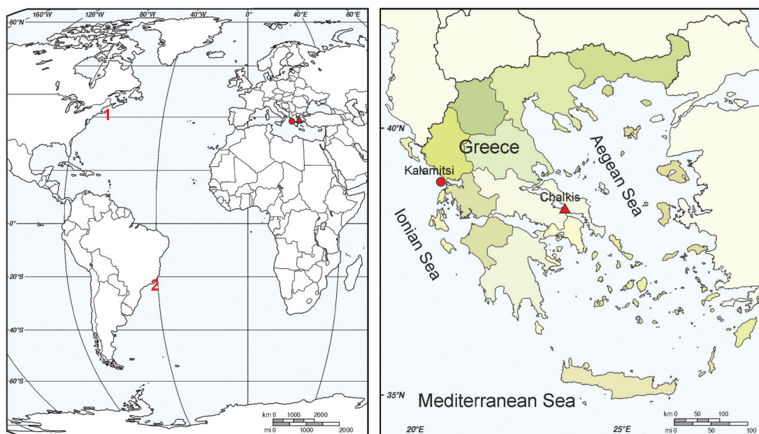
Fig. 1: Map showing world-wide records of Dipolydora blakei and collecting sites off Greece. 1 – continental slope off New England, U.S.A. (Maciolek, 1984); 2 – continental platform and slope off the states of São Paulo and Rio de Janeiro, Brazil (Radashevsky & Paiva, 2010); filled triangle – Aegean Sea, off Chalkis; filled circle – Ionian Sea, off Kalamitsi (present study).

and the Museum of Zoology of the State University of Campinas, Campinas, Brazil (ZUEC) were also examined.