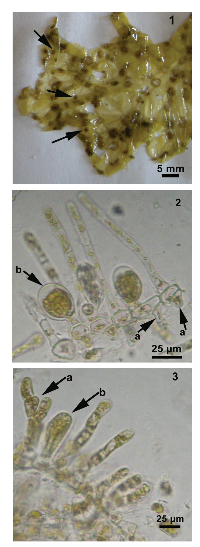
Figs 1-3: Ulonema rhizophorum. Fig. 1. Habit (arrows), on Ulva sp. Fig. 2. Monostromatic basal layer, downwardly produced rhizoids (a) and unilocular sporangia (b). Fig. 3. Erect branched filament (a) and unilocular sporangia (b).

The genus Ulonema shows similarities to the other myrionematoid genera Myrionema and Microspongium , but differs from those in having irregularly spreading basal filaments and downwardly produced branched rhizoidal filaments from the basal system (Foslie, 1894; Sauvageau, 1897; Fletcher, 1987; Taşkın et al. , 2006). More