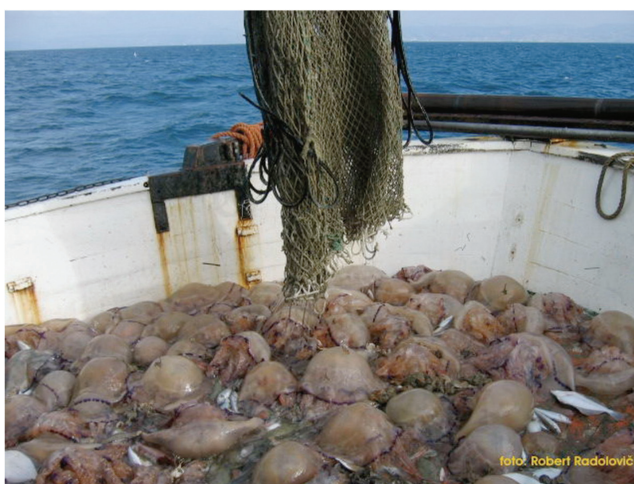
Fig. 2: ‘Fish’ catch in February 2004 in the Gulf of Trieste.

In contrast to long-term qualitative data about the presence of jellyfish in the northern Adriatic, limited quantitative abundance estimates are available. After rather high abundances of barrel jellyfish in 2003, the Piran Marine Biology Station (MBS) started a more systematic survey in 2004. These jellyfish were numerous during cold months, from December to February, decreased from summer 2005 onwards (Table 1), and was < than 10 ind./km 3 in May 2006. Our regular quantitative