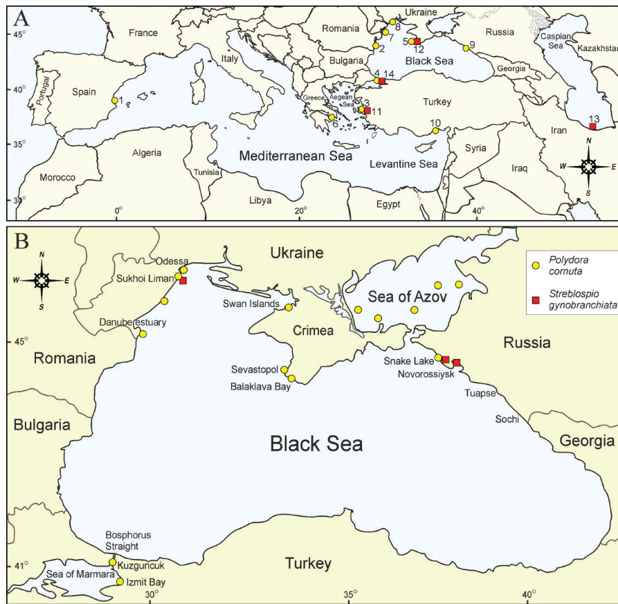
Fig. 1: Maps showing previous (A) and present (B) records of spionid polychaetes in the Mediterranean, Black and Caspian Seas and the Seas of Azov and Marmara: Polydora cornuta (yellow circles): 1 – Tena et al. (1991); 2 – Radashevsky (2005), Surugi et al. (2005, 2006, 2012), Surugi & Novac (2007); 3 – Çinar et al. (2005b, 2012a); 4 – Dağlı & Ergen (2008), Karhan et al. (2008), Çinar et al. (2009); 5 – Boltacheva & Lisitskaya (2007); 6 – Simboursa et al. (2008); 7 – Bondarenko (2011); 8 – Losovskaya (2011); 9 – Selifonova (2011); 10 – Çinar et al. (2012b). Streblospio gynobranchiata (red squares): 11 – Çinar et al. (2005 a,b, 2012a), Dağlı et al. (2011); 12 – Boltacheva (2008); 13 – Taheri et al. (2008), Taheri & Foshtomi (2011); 14 – Çinar et al. (2009).

ova, 2012). Sevastopol and Odessa are among the largest seaports in Ukraine in the north and north-western parts of the Black Sea, respectively. Recent sampling in Novorossiysk Bay and the port of Tuapse, and samples previously collected in Sevastopol, Odessa and adjacent areas, provided good material for taxonomic revisions and better insight into the regional distribution of invasive species of Spionidae.