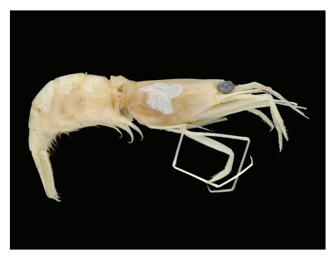
Fig. 2 : Nikoides sibogae De Man, 1918, Haifa Bay, Israel. Colors faded following preservation in ethanol.