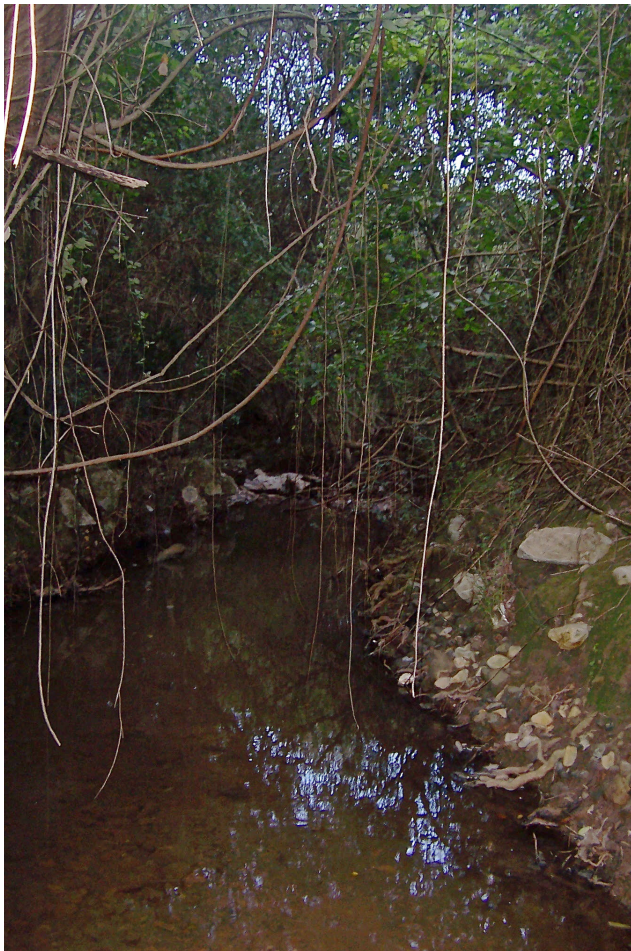
Fig. 2: Habitat of E. pungens in the Titria River, Tunisia.

Diagnosis of Tunisian male specimens: All the morphological features described below are illustrated in Fig. 3. Medium large species, the maximum length of males