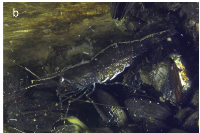
Fig. 2: Palaemon macrodactylus , northern Adriatic Sea: a) Pialassa Baiona, 13 April 2011; b) Sacca di Goro, 22 June 2011.

The BLAST search resulted in a 100% match of the 533 bp of the 16S sequence obtained in the present study with the 2 sequences of P. macrodactylus deposited at Genbank. One sequence (511 bp) belongs to a specimen from Tokyo