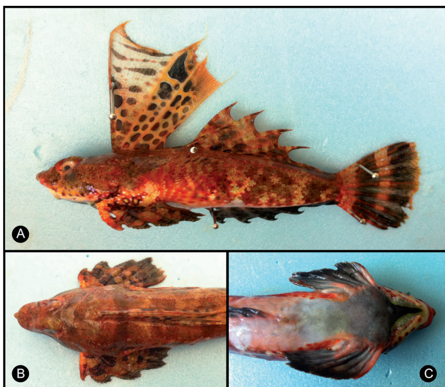
Fig. 2: Synchiropus sechellensis specimen caught in the Mediterranean Sea (A: Body, B: Dorsal view of head, C: Ventral view of head).