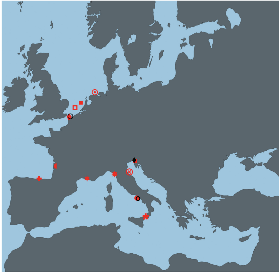
Fig. 1: European distribution of the invasive calanoid copepod Pseudodiaptomus marinus . ○: Gravelines (France) (Brylinski et al. , 2012); ◆: Calais (France) (Brylinski et al. , 2012); ◐: Bay of Biscay (France) (Brylinski et al. , 2012); ◑ and ◒: Southern North Sea (Jha et al. , 2013); ⊙: North Sea (German exclusive economic zone) (Jha et al. , 2013); ⊗: Rimini (Italy) (De Olazabal and Tirelli, 2011); ◆: Monfalcone (Italy) (De Olazabal & Tirelli, 2011); ★: Berre Lagoon (France) (Delpy et al. , 2012); ★: Lake Faro and Lake Ganzirri (Italy) (present work); ○: Gulf of Naples (Italy) (two sites: St. LTER-MC and an offshore sampling site) (present work); ●: Lake Fusaro (Italy) (present work); ◐: Marina di Carrara (Italy) (present work); ◑: Gulf of Trieste (Italy) (St. LTER-C1); +: Bilbao (Spain) (present work). Coastline data: NOAA National Geophysical Data Center, Coastline extracted: WLC (World Coast Line), Date Retrieved: 08 January, 2013, http://www.ngdc.noaa.gov/mgg/shorelines/shorelines.html .

(northeastern Adriatic) in May 2009 (De Olazabal & Tirelli, 2011) (Fig 1). Afterwards, it was not possible to assess whether the species had successfully survived in the area as no more samplings in the same area have been performed. In this case, it was hypothesized that P. marinus had arrived more likely through aquaculture rather than ballast waters (De Olazabal & Tirelli, 2011). At that time, P. marinus had not yet been recorded in the nearby St. LTER-C1 in the Gulf of Trieste (as discussed in De Olazabal & Tirelli, 2011). Later on, the species has been found in several other Adriatic coastal sites between 2011 and 2013, as well as at station LTER-C1 in the Gulf of Trieste (Tirelli, personal communication).