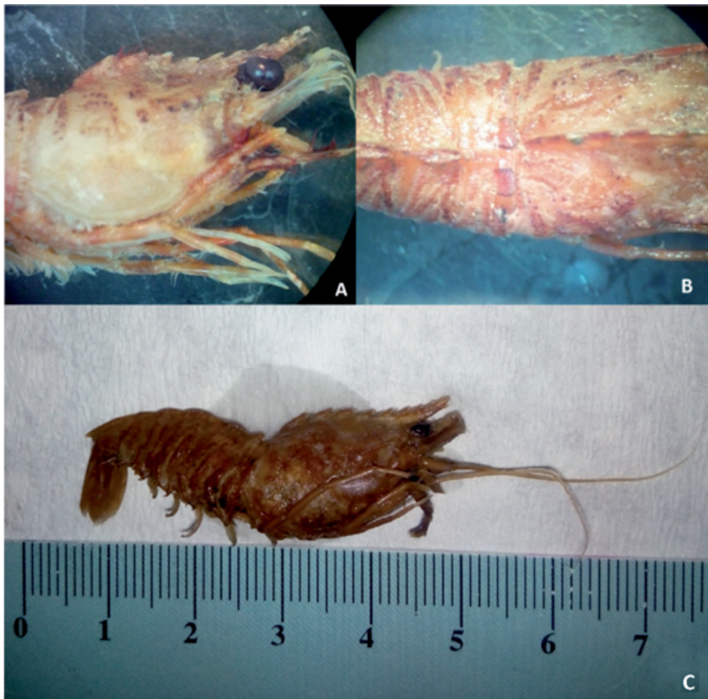
Fig. 2: A. Lateral view of carapace, B. and dorsal view, C. whole animal (lateral view).

The present species is known to inhabit soft substrates, such as sand and mud bottom, and its depth range distribution is from shallow waters of 25 m to 200 m, usually less than 100 m. It is a species more active in nighttime, and probably burrows in sand during the