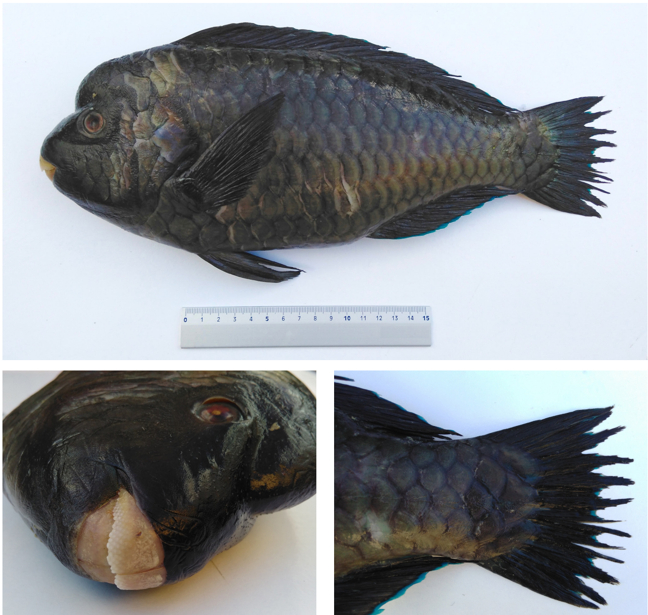
Fig. 3: The adult female of Chlorurus rhakoura (MSNC 4547) caught off Portopalo, Syracuse, Italy. Detail: premaxillary dental plate with 2 short, laterally-projecting teeth (a), exerted rays of caudal fin (b).

pogenic activities. Today, great attention is paid to unintentional pathways of aquatic alien species introductions through ballast-water (Carlton and Geller, 1993; Ruiz et al. , 1995), transport via trailer boats (Leung et al. , 2006; Rothlisberger et al. , 2010), bait-bucket releases by anglers (Litvak and Mandrak, 1993; Di Stefano et al. , 2009), and escapes associated with aquaculture (Naylor et al. , 2001; De Silva et al. , 2009) or aquarium trade (Katsanevakis et al. , 2013). Moreover, intentional release in the wild of marine species kept in aquaria is also acquiring importance as a pathway of introduction (Zenetos et al. , 2016).