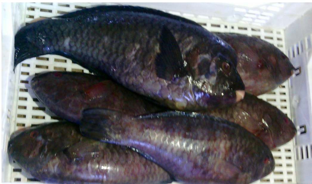
Fig. 2: The six freshly caught specimens of Chlorurus rhakoura photographed in the fish market of Portopalo.