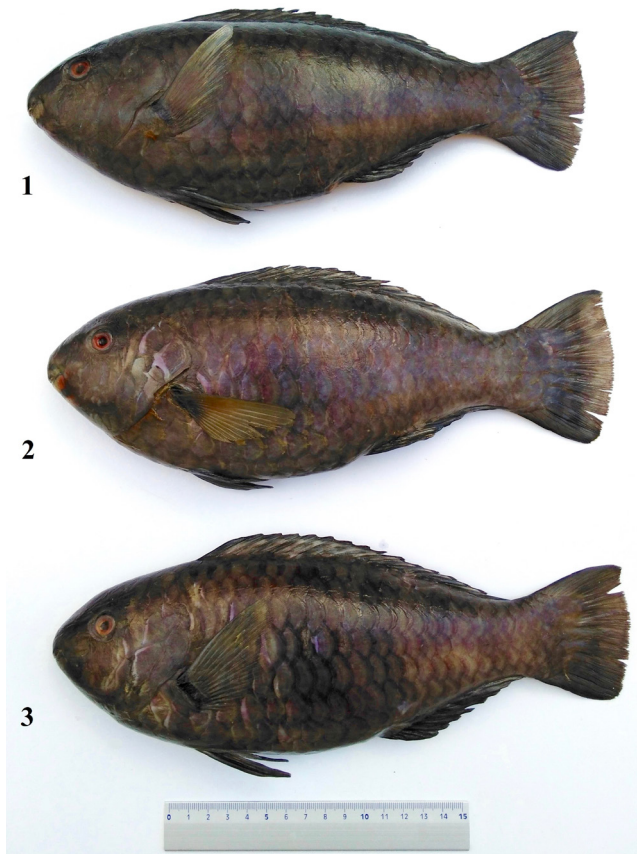
Fig. 4: Subadult females of Chlorurus rhakoura (MSNC 4548-1; MSNC 4548-2; MSNC 4548-3) caught off Portopalo, Syracuse, Italy.

70 vessels arriving at Chesapeake Bay harbours, 90% of these live organisms are transported in ballast water, including clams and mussels, copepods, barnacles, diatoms, and juvenile fish (Chesapeake Bay Commission, 1995; Darby, 1997). According to Deidun et al. (2016), shipping is the leading vector for trade in the world and alone is currently responsible for transporting over 80% of world commodities (UNCTAD/RMT, 2014). Concurrently, the global shipping sector transports approximately three to five billion tons of ballast water internationally every year (GLOBALLAST, 2015). Although ballast water is essential for the safe and efficient cargo operations of all types of vessel, such a process also constitutes a serious threat to ecological, economic and human health systems due to the inadvertent introduction of invasive aquatic species in new marine regions. It is expected that increases in transoceanic vessel traffic (using current ballast practices) will multiply the risk, since introductions are likened to “ecological roulette,” that is, the greater the number of releases with potential invasive species, the more likely it is for an invading species to successfully colonize and grow in numbers (Carlton, 2001a, b; Kolar & Lodge, 2001; Tzankova, 2001). It is thought that the origin of transo-