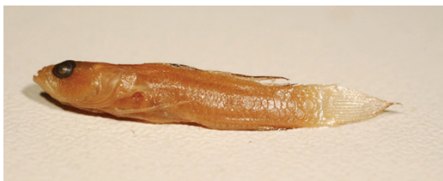
Fig. 11: Odondebuena balearica , PMR VP4399, male, 16.9+4.6 mm, off Qawra point, Malta.

dal fin damaged, off east Comino, Comino, 36.01733° N, 14.38483° E, coll. Patrick J. Schembri, 7 April 1998; PMR VP4432, juvenile of unidentified sex, 11.2+3.0 mm, off St. Paul's Islands, Malta, 35.97693N, 14.42405° E, coll. Joseph A. Borg, April 2003; PMR VP4433, female, 13.3+3.9 mm, off Zonqor Point, Malta, 35.90917° N, 14.70518° E, coll. Joseph A. Borg, June 2010; PMR VP4434, female, 17.9+4.7 mm and two males, 18.2 mm standard length, caudal fin damaged and 13.9+4.2 mm, off Zonqor Point, Malta, 35.90917° N, 14.70518° E, coll. Joseph A. Borg, June 2008; PMR VP4435, female, 13.9 mm standard length, caudal fin damaged, off Zonqor Point, Malta, 35.89445° N, 14.70677° E, coll. Joseph A. Borg, June 2008; PMR VP4436, male, 13.8+4.4 mm, off Zonqor Point, Malta, 35.892° N, 14.66833° E, coll. Joseph A. Borg, June 2010; PMR VP4437, juvenile of unidentified sex, 12.6+3.6 mm, off St. Paul's Islands, Malta, 35.97693° N, 14.42405° E, coll. Joseph A. Borg, November 2000.