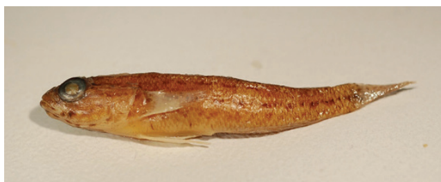
Fig. 7: Gobius fallax , PMR VP4395, juvenile of unidentified sex, 25.8+6.1 mm, St. Thomas Bay, Malta.

Remarks. The present report represents the southernmost record of this species in the central Mediterranean. It is otherwise known from the Canaries in the Atlantic, along the north Mediterranean coasts and from Cyprus in the Levant (Kovačić et al. , 2011).