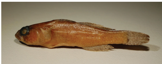
Fig. 6: Gobius ater , PMR VP4403, male, 31.7+8.1 mm, St. Thomas Bay, Malta.

Remarks. This elusive species described 130 years ago is still known from a total of only seven localities including the present records: Balearic Islands (Lozano y Rey (1919), Nice (Bellotti, 1888), Sardinia (Tortonese & Chessa (1982), Sicily (Gramito, 1993), Malta (present