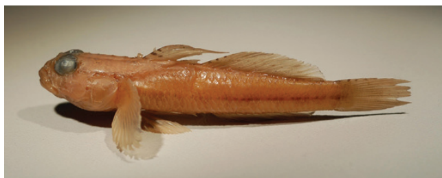
Fig. 9: Gobius roulei , PMR VP4378, male, 47.7+11.1 mm, off St. Paul's Islands, Malta.

Remarks. The present report represents the southernmost record of this species in the central Mediterranean. It is otherwise known from off the south-west coast of Portugal in the Atlantic, along the north Mediterranean coasts, and from Cyprus in the Levant (Liu et al. , 2009).