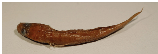
Fig. 5: Chromogobius zebratus , PMR VP4376, male, 26.3+6.7 mm, Mellieha Bay, Malta.

Remarks. The present report represents the southernmost record of this species in the central Mediterranean. It is otherwise known from Cadiz Bay in the Atlantic, and along the north Mediterranean coasts to Turkey in the east (Engin & Dalgıç, 2008).