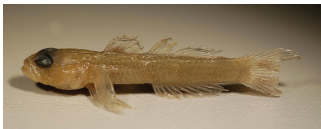
Fig. 13: Vanneaugobius dollfusi, PMR VP4386, male, 21.5+5.7 mm, off St. Paul's Islands, Malta.

Remarks. The present report represents the southernmost record of this species in the Mediterranean. Previous to the present record, V. dollfusi has been reported from the Atlantic coast of Morocco, the Strait of Sicily, the Aegean Sea and the Adriatic Sea (Consoli et al. , 2019).