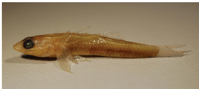
Fig. 12: Speleogobius llorisi , PMR VP4377, male, 16.1+4.4 mm, off Delimara Point, Malta.

Diagnosis. (1) suborbital papillae of lateral-line system with longitudinal row a ; (2) posterior oculoscapular head canal of lateral-line system absent; (3) preopercular head canal present with pores \gamma , \delta , \epsilon ; (4) pelvic fins united