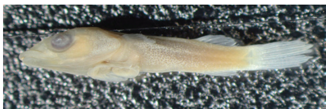
Fig. 2: Apletodon incognitus , PMR VP4421, juvenile of unidentified sex, 11.7+2.8 mm, Sikka l-Bajda off NE Malta, Malta.

Diagnosis. (1) three lachrymal canal pores; (2) three mandibular canal pores; (3) dorsal and anal fins normal, with strong rays; (4) dorsal fin rays 4-6, anal fin rays 4-6 (present material dorsal fin 4-5, anal fin 4-5); (5) no spine in subopercular region; (6) row of papillae present on central part of anterior half of sucking disc from region A to region C.