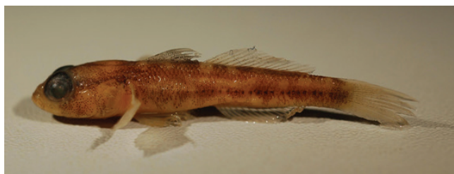
Fig. 8: Gobius gasteveni , PMR VP4373, juvenile female, 27.8+7.5 mm, off Zonqor Point, Malta.

Remarks. The present report represents the easternmost record of this species otherwise known only from the northeastern Atlantic and western Mediterranean (Ahnelt et al. , 2011).