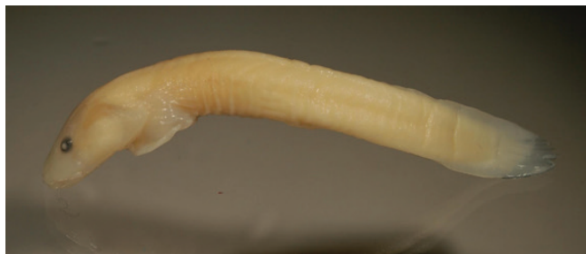
Fig. 3: Gouania wildenowi, PMR VP4374, male, 41.1+5.8 mm, Wied il-Ghasri, Gozo, Malta.