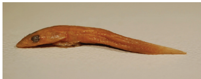
Fig. 4: Opeatogenys gracilis , PMR VP4388, male, 17.8+3.6 mm, Mellieha Bay, Malta.

Material examined. PMR VP4388, male, 17.8+3.6 mm, Mellieha Bay, Malta, 35.9759° N, 14.36612° E, August 2000 (Fig. 4); PMR VP4389, juvenile of unidentified sex, 8.8+1.9 mm, Mellieha Bay, Malta, 35.9759° N, 14.36612° E, August 2000; PMR VP4390, juvenile of unidentified sex, 9.9+2.5 mm, Mellieha Bay, Malta, 35.9759° N, 14.36612° E, August 1999; PMR VP4391, juvenile of unidentified sex, 9.8+2.3 mm, Mellieha Bay, Malta, 35.9759° N, 14.36612° E, August 1999; PMR VP4392, male, 10.9 mm standard length, caudal fin damaged, White Rocks, Malta, 35.93895° N, 14.46538° E, August 1999; PMR VP4393, male, 18.3+3.8 mm, White Rocks, Malta,