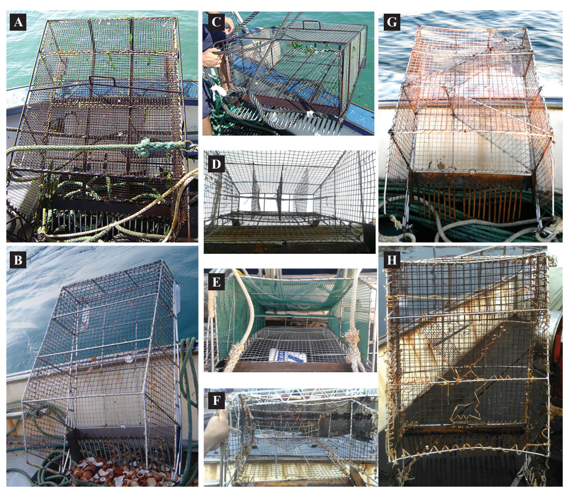
Fig. 2: (A-C) Clam dredges used on the Mediterranean coast of Spain (including the Maresme coast) (frame mouth width 70 cm; height 53 cm; depth 120 cm). Back part of the clam dredges is meshed. Mesh to target wedge clam and striped venus clam is 13 \times 13 mm, whereas dredges to target smooth clam is 29 \times 29 mm (D-H). Different types of worm bait dredges used by fishermen on Maresme coast. The worm bait commercial mesh size is 29 \times 29 mm, but the back part of the dredge is open.

Epibenthic and infaunal species appear frequently as a by-catch in the worm bait fishery; i.e. mainly bivalves ( Callista chione , Mactra corallina and Donax variegattus ), crustaceans ( Thia scutellata , Portunus hastatus and Lambrus angulifrons ) and echinoderms ( Echinocardium sp. and Astropecten sp.). All the by-catch fauna is returned alive to the sea after each trawl.