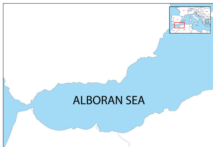
Fig. 1: Map of the Northern Alboran Sea (Geographical Subarea 1 according to General Fisheries Commission for the Mediterranean, GFCM division.).

Total length (TL, cm) from the tip of the snout to the tip of the longer lobe of the caudal fin was recorded by a measuring board. Total body weight (TBW, g), liver weight (LW, g), digestive weight (DW, g) and fillet weight (FW, g) were recorded using a balance to the