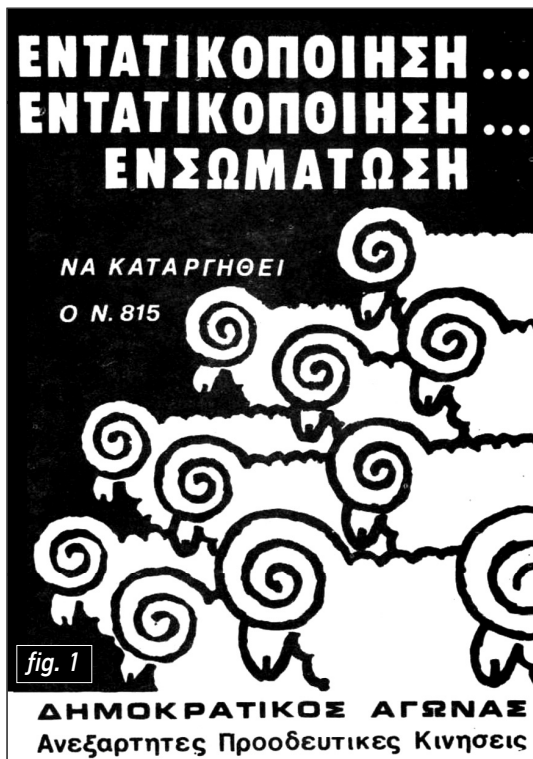
Poster published by the student group of B' Panelladiki, 1979 30

ground. It was mainly during and after the 1979 occupations that in practice B' Panelladiki became less visible as a distinct force and operated mostly within wider groupings, such as the fluid network of Choros. Thus, especially since late 1979, the texts produced by Choros reproduced a self-representation of an incomplete, inconsistent collective self. In this vein, autonomous young left-wingers were certainly fascinated with slogans and images of '1968', which served as an impetus for challenging established social and political patterns, signifying the protest of the network against “ensomatosi” (integration). The autonomous young leftwingers, however, would prove reminiscent of 1968 through the scattered images or slogans that appeared in the texts of Choros. These images and slogans were not linked in an explicit way with the content of the text they supplemented. Sometimes, the very fact that these representations emanated from the youth revolts of 1968 in Western Europe was usually not mentioned, as these