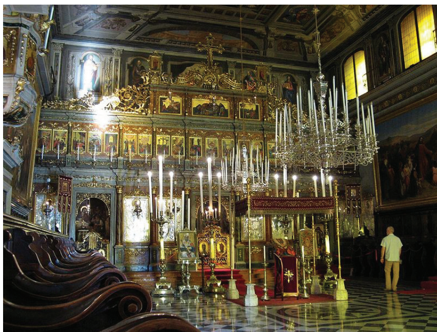
Fig. 17. Interior view of St Nicholas and Holy Trinity of the Greeks, Trieste.

If we take into consideration that the studies of the painter from Kefalonia in Italy and the transfer of his works to Corfu were carried out in very