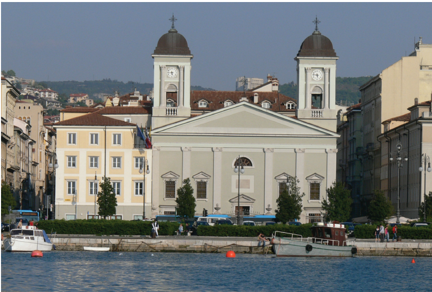
Fig. 13. St Nicholas and Holy Trinity of the Greeks, Trieste.