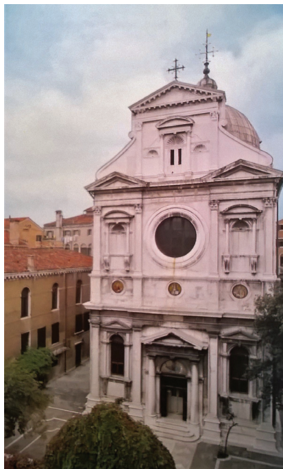
Fig. 2. St George of the Greeks, Venice.

At this point a key issue arises, which is related to the artistic choices of the Orthodox Greeks who lived and prospered in the Italian cities, 11 in a purely Catholic environment, choices that were not in agreement with their degree of familiarity with Italian artistic ways, especially if they came from Crete or the Ionian Islands. It would be very interesting to study in detail the degree to which their undoubted bonds with the Orthodox liturgy and the artistic tradition, as well as their will to introduce the "pittura greca" to the interior decoration of churches, were influenced and formed by the artistic environment of Italy. Beginning with Venice and, in particular, with the Late Renaissance church of St George of the Greeks (fig. 2), 12 built by the famous Italian architect of Santa Maria della Salute, Baldassare Longhena, 13 it is important to stress that from Naples to Trieste the choices of the architectural type and the exterior decoration of the churches – as we will see later – absolutely conformed to the contemporary dominant architectural style of the Italian cities. The choices of the painters and their art became an issue only with respect to the interior decoration, where the icons were directly associated with dogma and worship.