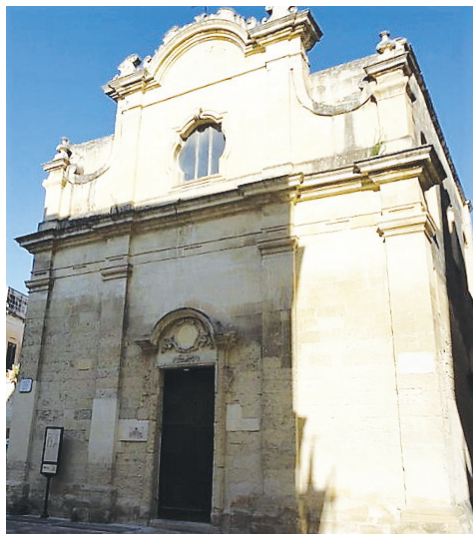
Fig. 7. St Nicholas of the Greeks, Lecce.