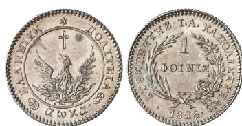
Fig. 1. The silver phoenix, the emblem and currency of Greece during the Kapodistrian administration (1828-1831).

literature teemed with references to the rebirth of Greek values, a dominant idea encapsulated in the early Greek national insignia: the phoenix, reborn from its ashes, was the device of the Sacred Band, the company of Greek volunteer students who fought and perished under Ypsilantis at the Battle of Dragassani (Moldavia, 1821), and the first Greek national emblem during the Kapodistrian administration (fig. 1). 42 Here too, however, the resilience of philhellenism should be pointed out: there was mutual mistrust, as well as disappointments in Greece and excesses provoked by the philhellenic frenzy in Europe, as E. T. A. Hoffmann acidly recorded. 43