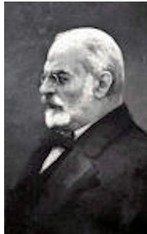
Fig. 2. Petros Protopapadakis.