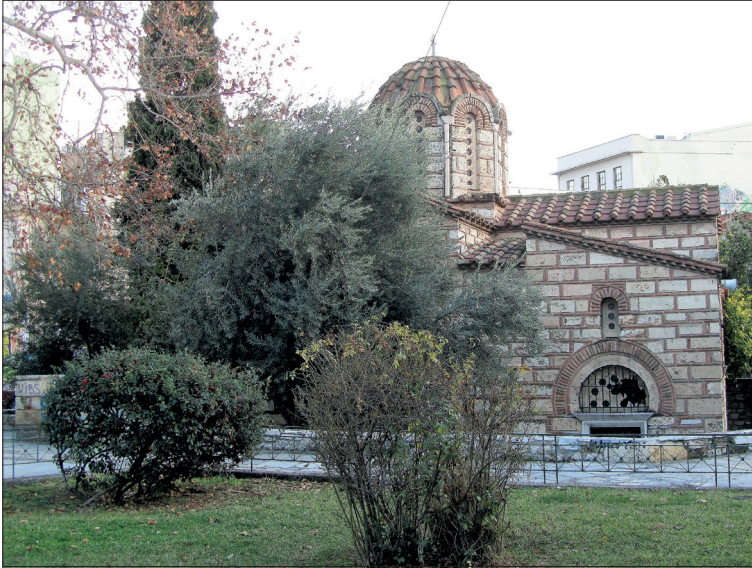
Fig. 8. Agioi Asomatoi in Thiseio. First half of the eleventh century.

carried out by Cistercian monks during the Latin occupation of Athens, has been designated a UNESCO World Heritage Site and, also because of its superb mosaic decoration, attracts large numbers of Greek and foreign visitors.