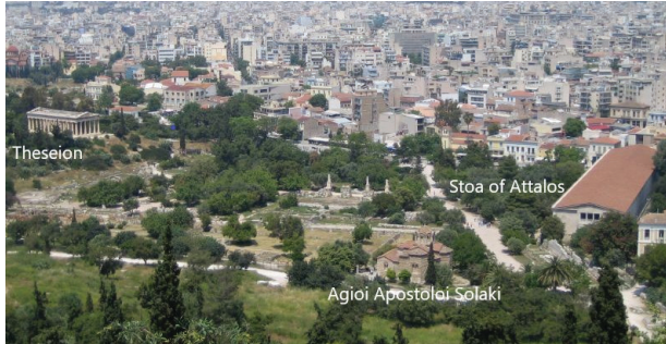
Fig. 4. Ancient Agora of Athens.

Roman Agora were removed, for the sake of excavating earlier strata, while the demolition of the middle Byzantine churches of Profitis Ilias (1848) and the Taxiarchai (1850) (fig. 3) had already paved the way. 46 In an attempt to give prominence to the purity of the classical form of the Propylaea, the Frankish Tower 47 on the Acropolis was dismantled in 1875 by the Archaeological Society