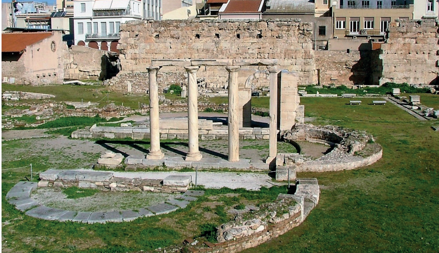
Fig. 7. Remains of the three phases of the medieval church in the court of Hadrian's Library.

a curved marble frieze with floral decoration in relief, which probably belonged to the interior decoration of the apse, 79 a marble slab from the ambo 80 and four inscribed fragments from the architrave of the phiale . 81