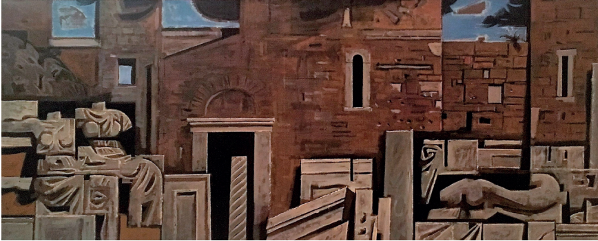
Fig. 10. Byzantine Athens, detail. Oil on canvas, by Yannis Moralis, 1966–1967. Private collection.

Athens is still renowned and admired worldwide for its classical past, with its medieval cultural heritage much less highlighted. The painting “Byzantine Athens” (1966–1967) 105 (fig. 10) by Yannis Moralis (1916–2009), recently presented in a retrospective exhibition 106 of this prominent painter of the Greek twentieth-century avant-garde , epitomises the modern (and postmodern) perception of medieval Athens as a city with a mixed – pagan and Christian – identity par excellence. In a two-layered composition, antique statues and architectural sculptures of white marble in the foreground set against the dull, earthy-coloured backdrop of a Byzantine church, an optical complement to them, capture the viewer’s attention.