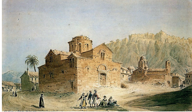
Fig. 3. Churches of Profitis Ilias and Taxiarchai. Engraving by James Skene, 1838.

– with very few exceptions 42 – in the demolition of major medieval monuments and building remains for the benefit of antiquities, without, in many cases, systematic documentation. 43 Among the characteristic examples of this practice was the demolition of all middle Byzantine antiquities within Hadrian’s Library during the excavations conducted in 1885 and 1886, 44 and also, in 1849, of the middle Byzantine church of Asomatos “Sta Skalia” (“On the Steps”), which was immediately adjacent to the facade of the Library. 45 Furthermore, from 1862 onwards, all remains of the Byzantine neighbourhood established inside the