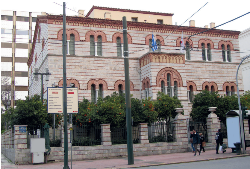
Fig. 5. Athens Ophthalmological Clinic, 1843–1855.

started to record Byzantine monuments in Athens, Thessaloniki and other regions in Greece with measured drawings, watercolours and photographs. 58 Other members of the British School at Athens also produced, from 1890 to 1903, photographs and drawings of Byzantine and post-Byzantine monuments of Attica, now kept in the archives of the school. 59 Restoration work on Byzantine monuments commenced towards the end of the nineteenth century and one of the first monuments to be treated, with the participation of European experts, was Daphni Monastery (1885–1897). 60