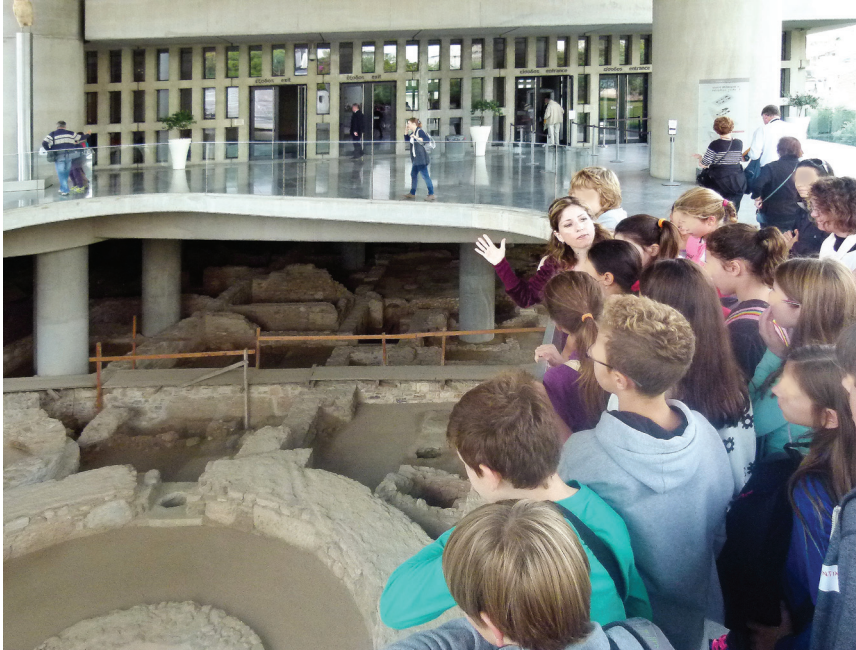
Fig. 9. The Acropolis Museum, the architectural remains.

South-east of the Odeon of Herodes Atticus, on the pedestrian precinct of Dionysiou Areopagitou Street, the ground plan of the House of Proclus can be traced within the slabs. Proclus (412–485), a Neoplatonic philosopher, was the scholar of the Neoplatonic Academy in Athens from 450 until his death. His large villa, dated to the early fifth century, was excavated hurriedly