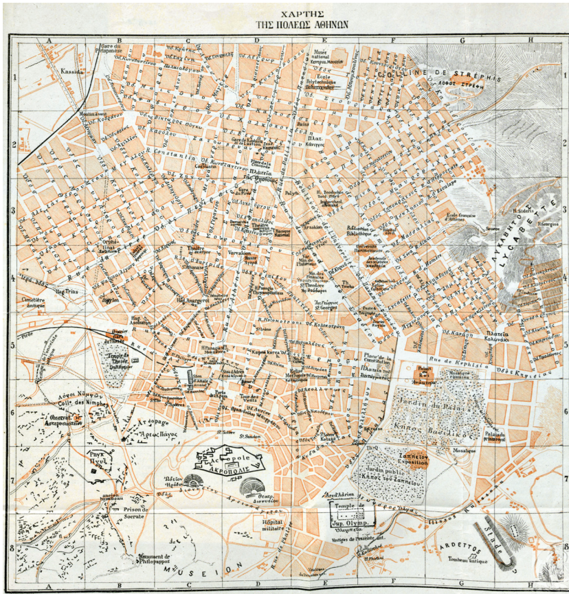
Fig. 6. Map of modern Athens, 1890, from Nikolaos G. Politis (ed.), Λεξικόν εγκυκλοπαιδικόν [Encyclopaedic dictionary], vol. 1, Athens: Bart and Hirst, 1889, p. 213.

Significant for the cultural life in Greece during this period was the foundation of the Ministry of Culture and Sciences (the present-day Ministry of Culture and Sports) in 1971 during the dictatorship of the colonels to manipulate artistic and spiritual creation. Its development in normal political conditions, after the restoration of democracy, into a dynamic administrative institution with policies based on the concept “diachrony and synergy” 73 has given the