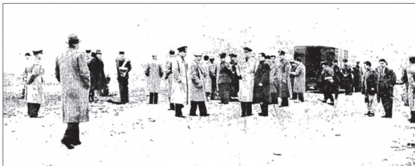
Fig. 1. Policemen and experts at the scene of the crime in Mikra. Μακεδονία , 6 March 1959.

connection of sexuality with marriage and the structure of the Greek family, where young and even middle-aged unmarried but also divorced people often lived with their parents, did not facilitate extramarital sexual intercourse at home, leading lovers to public, albeit secluded, spaces. 25 Infrastructures facilitating connections between the city centre and surrounding areas (for example, beaches), but also growing automobility, as in the case of the couple of the second crime (in Mikra), gave people the opportunity to reach remote “romantic” areas to make out. 26 This, however, led to worries about the control of these areas, especially after dark. The struggle of the authorities to supervise remote areas is eloquently visualised in a large photo published in Μακεδονία after the crime in Mikra depicting policemen and experts meticulously researching the crime scene (fig. 1).