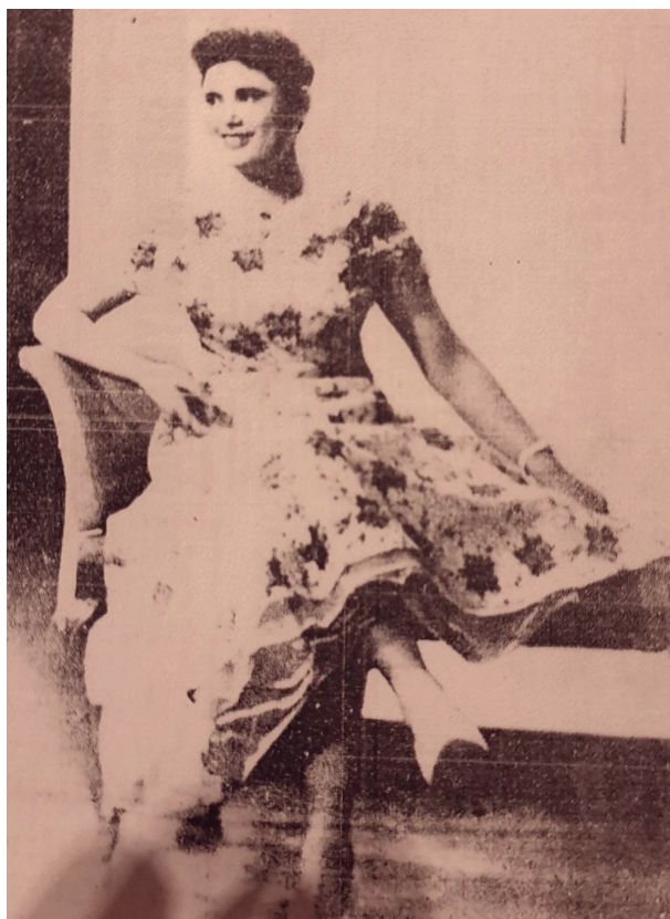
Fig. 4. The victim of the crime in Mikra. Βραδυνή, 10 March 1959.