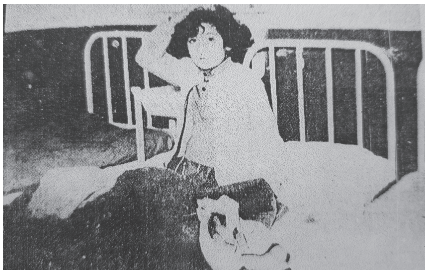
Fig. 6. The victim of the crime at the orphanage. Μακεδονία , 8 December 1963.