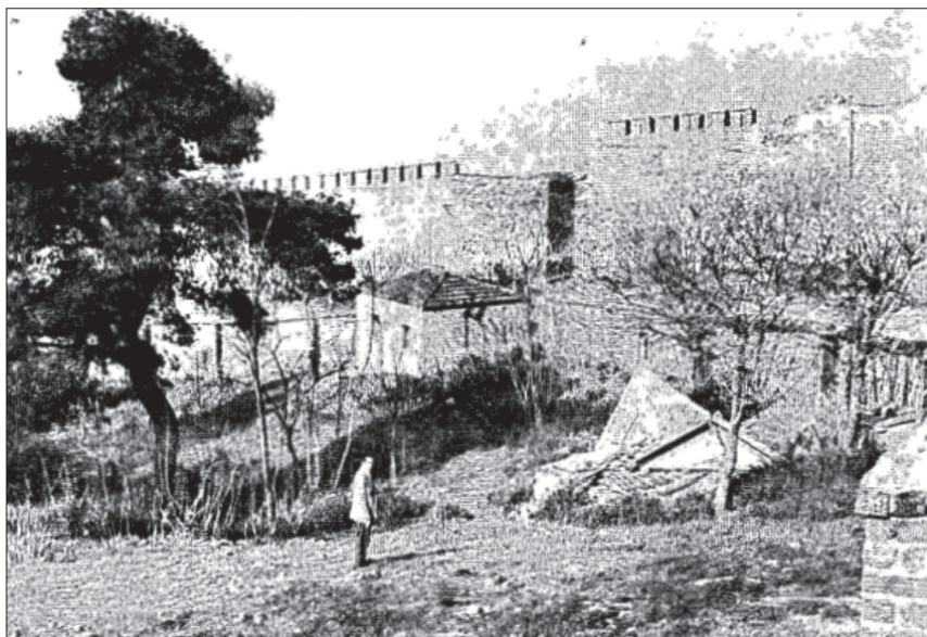
Fig. 2. The wall of the municipal hospital, where the third crime took place. Μακεδονία , 5 April 1959.

girl” and “rushed in a deranged way”, kissing and biting her. 33 As had happened in other national contexts in earlier times, such as late Victorian Britain and fin-de-siècle France, the press willingly published details of sexual crimes. 34 In the French and British context, such representations went against a climate of silence around sex. In postwar Greece the situation was more complicated: discussions about sex were still absent in the family and education, but bold sexual representations were not uncommon in the cultural industry (in cinema, for example), especially from the early 1960s.