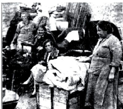
Figure 3. Photograph showing residents in an area along the Kifisos left homeless after the November 1934 flood. Ελεύθερος Άνθρωπος , 24 November 1934.