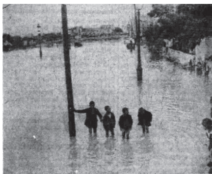
Figure 4. Photograph of the aftermath of the November 1934 flood. The caption reads: “Another picture of the phenomenal flood ... A whole square, where children played, was transformed into a lake.” Ακρόπολις , 23 November 1934.

Often the Kifisos was accused of being the actual offender. Following a flood on 22 November 1934 (figs. 3 and 4), in which seven people lost their lives, some reports attempted to direct the people’s anger and despair at the river.