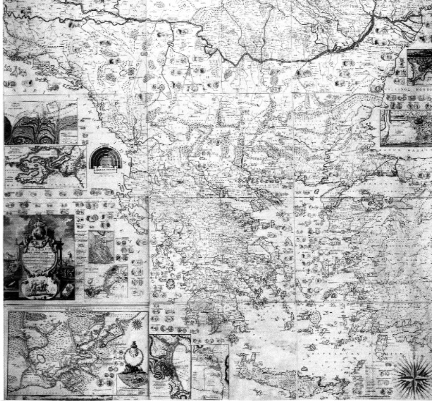
Fig. 3. Rhigas Velestinlis, Chart of Greece, in which are comprised her islands, and part of her numerous colonies in Europe and Asia Minor (12 sheets, Vienna: Franz Th. Müller, 1797).