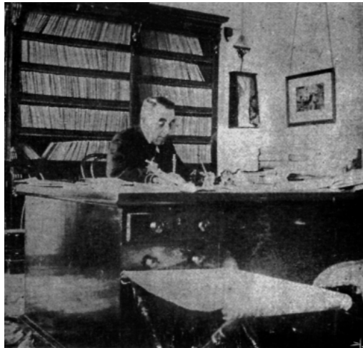
Dimitrios Vikelas in his study at the Society for the Distribution of Useful Books.

The story takes place in Smyrna, Chios, Syros and the islands. The “hero”, Loukis, looks back as an old man on the desperate adventures of his youth. The book is a patriotic, moralistic adventure story written in easily accessible language. It lacks the romantic rhetoric and heroism of earlier stories of the struggle for independence. It is very down to earth, and Loukis is something new to Greek literature. Things happen to him. He is carried along by events – something that must have been a common experience in the great flux of the 1820s. He is not a fighter, but a man who through patience, common sense and hard work becomes a successful merchant and prominent member of his community.