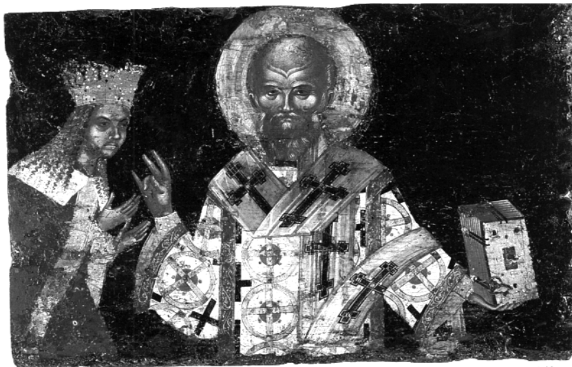
St Niphon and Neagoe Basarab.

Dionysiou monastery, Mount Athos, first quarter of the 16th century.