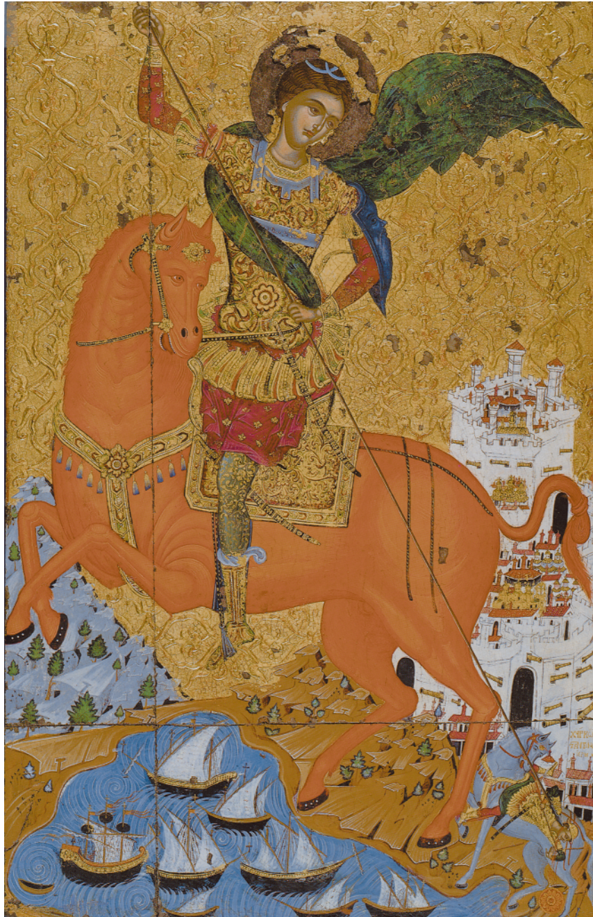
Fig. 2. St Dimitrios, about 1725, Collection of the National Museum of Medieval Art, Korčë.