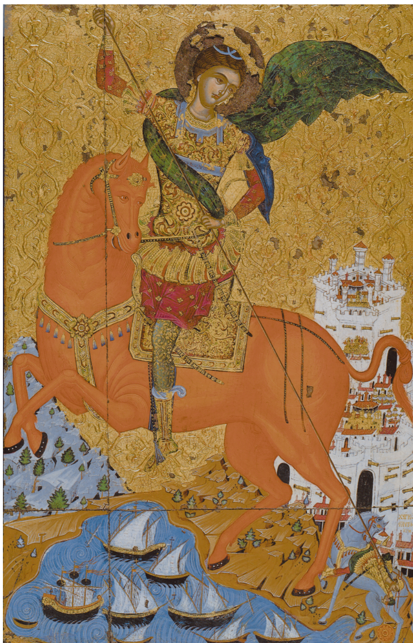
Fig. 2. St Dimitrios, about 1725, Collection of the National Museum of Medieval Art, Korçë.