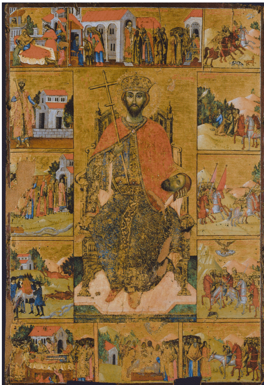
Fig. 4. St John Vladimir and scenes from his life, 1739, Collection of the National Museum of Medieval Art, Korčë.