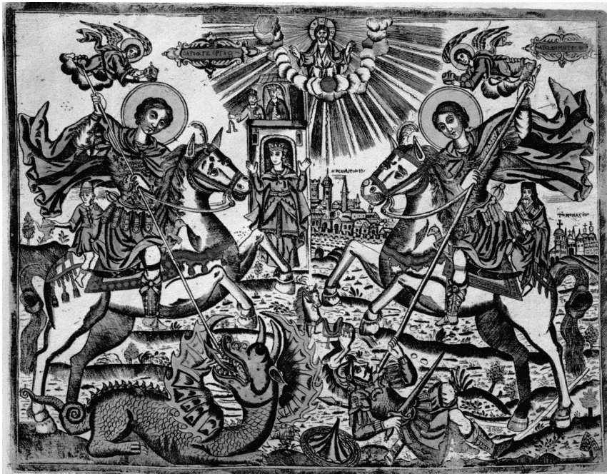
Fig. 3. Engraving with Sts George and Dimitrios, middle of the nineteenth century, Papastratos Collection, Museum of Byzantine Culture, Thessaloniki.