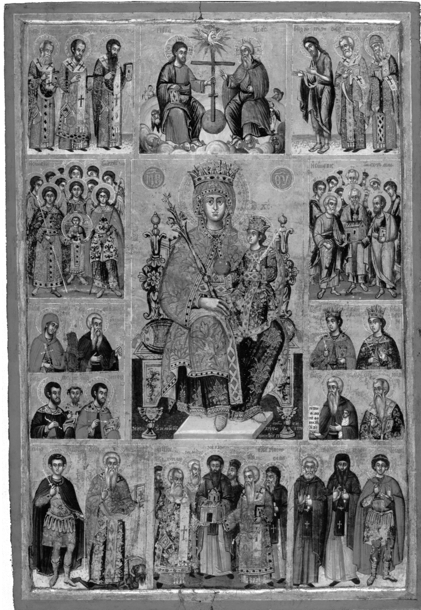
Fig. 6. The Virgin of the Unfading Rose with scenes and saints, 1773, Collection of the National Museum of Medieval Art, Korčë.