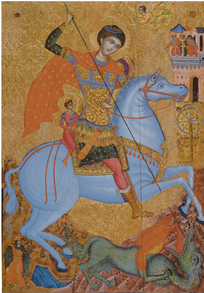
Fig. 1. St George, about 1725, Collection of the National Museum of Medieval Art, Korçë.