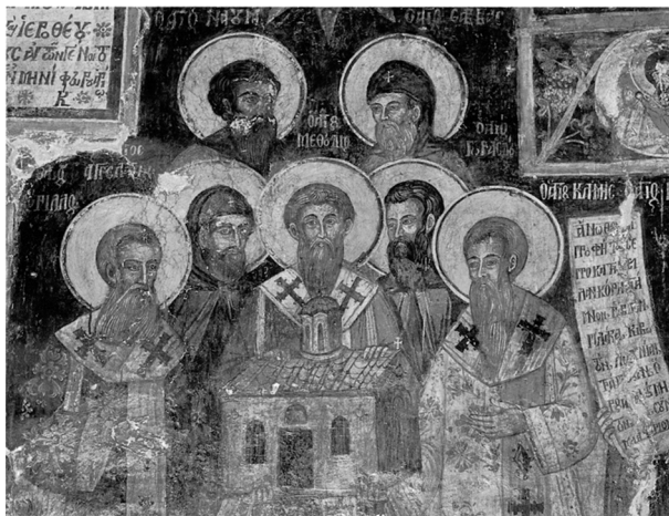
Fig. 7. The Seven Saints, wall-painting in the katholikon of the monastery of the Virgin, Ardenitsa.