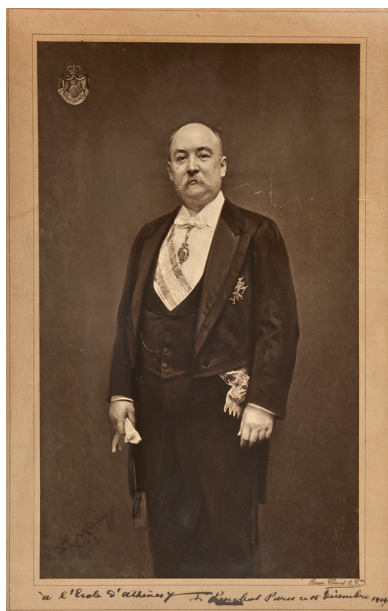
Figure 2. Picture of Joseph Florimond, duke of Loubat.

From the beginning of the twentieth century there were new economic activities on the island, which created work opportunities: the French excavations on Delos and mining activities in Ftelia. From 1903 to 1913 the EFA received 50,000 francs a year in sponsorship from the American Joseph Florimond, duke of Loubat. This rich patron (fig. 2), born in New York to French