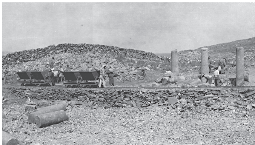
Figure 3. Photo from the excavation works of the Granite Palaistra, where workmen are using a Decauville railway and wagons.