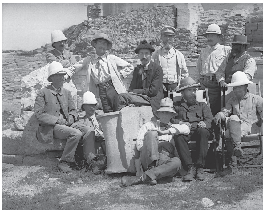
Figure 4. Photo of French and Danish researchers in the Hypostyle Hall (1909). Jean-Charles Moretti, Δήλος 1873–1913: Εικόνες μιας αρχαίας πόλης που έφερε στο φως η ανασκαφή (Athens: Melissa, 2017), 77, photo 14.

People of diverse origins, status and identities were brought together on the occasion of the Delos excavations. Archaeologists from other countries, such as Denmark, also participated in the French mission (fig. 4), as did non-Mykonian Greek foremen ( επιστάτες ) whom the EFA employed to supervise the works. As far as the Mykonians are concerned, few were educated or wealthy enough to appreciate antiquities and the discipline of archaeology (a bright example being the numismatist Ioannis Svoronos). For most of the poor workmen, the excavation was their first contact with systematic archaeological excavation. 24