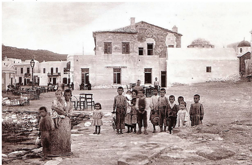
Figure 5. Children at Yialos, Hora. Panagiotis Kousathanas, Ενθύμιον Μυκόνου: Σχόλια σε φωτογραφίες , vol. 1, 1885–1950 (Heraklion: Crete University Press, 1998), 78, fig. 59.

Some very rare photographic evidence of daily life on the island survives from this period. For example, a photo dated to 1907 or 1908 depicting children at the port (fig. 5) subtly portrays existing economic and social differences in Mykonos at the time. None of the children are wearing shoes, except for the little girl in the centre, who is the famous writer Melpo Axioti (1905–1973). Axioti originated from a wealthy Mykonian family, who could afford shoes and good-quality clothes. Even though she was very young at the time of the Delos excavations, she was impressed by the coming and going of archaeologists, especially Stavropoulos, the Greek Ephor of Antiquities, whom she describes very vividly. 25