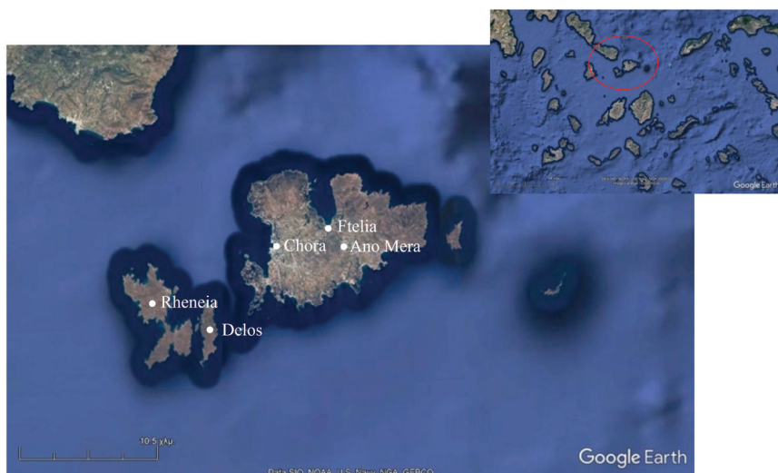
Figure 1. Map of Mykonos and the Deles depicting the sites mentioned in the text (inset map shows the islands' location in the Cyclades). Google Maps, with additions by the author.

also called Big Delos (Μεγάλη Δήλος), was a burial place in antiquity after 426 BCE, when the Athenians removed all the graves from small Delos, declaring it unlawful to be born or die on the island henceforth. 7 In more recent years, Rheneia has become a place for animal pasture, agriculture and fishing. 8 It is important to emphasise that until shortly after World War II, Rheneia was inhabited permanently by families who practiced farming intensively. 9 Both Delos and Rheneia are called the Deles (Δήλες) by the Mykonians. By the term “Mykonians” we refer to the island population of all three islands (Mykonos, Delos and Rheneia), unless otherwise stated.