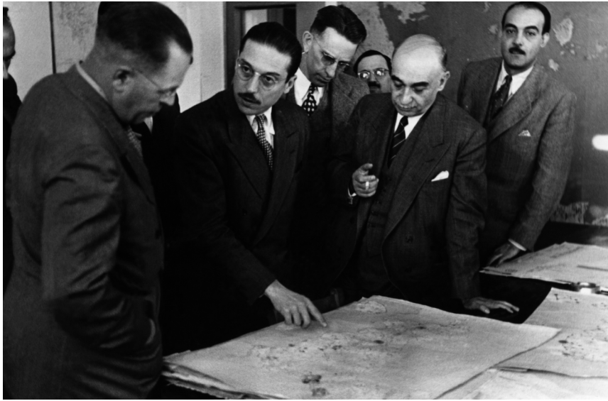
Fig. 1. American Mission for Aid to Greece (AMAG) chief Dwight Griswold (left) is given a tour of the Ministry for Reconstruction in December 1947.

The Minister, Dimitris Londos, stands to the right, as Constantinos Doxiadis (centre) makes the presentation.