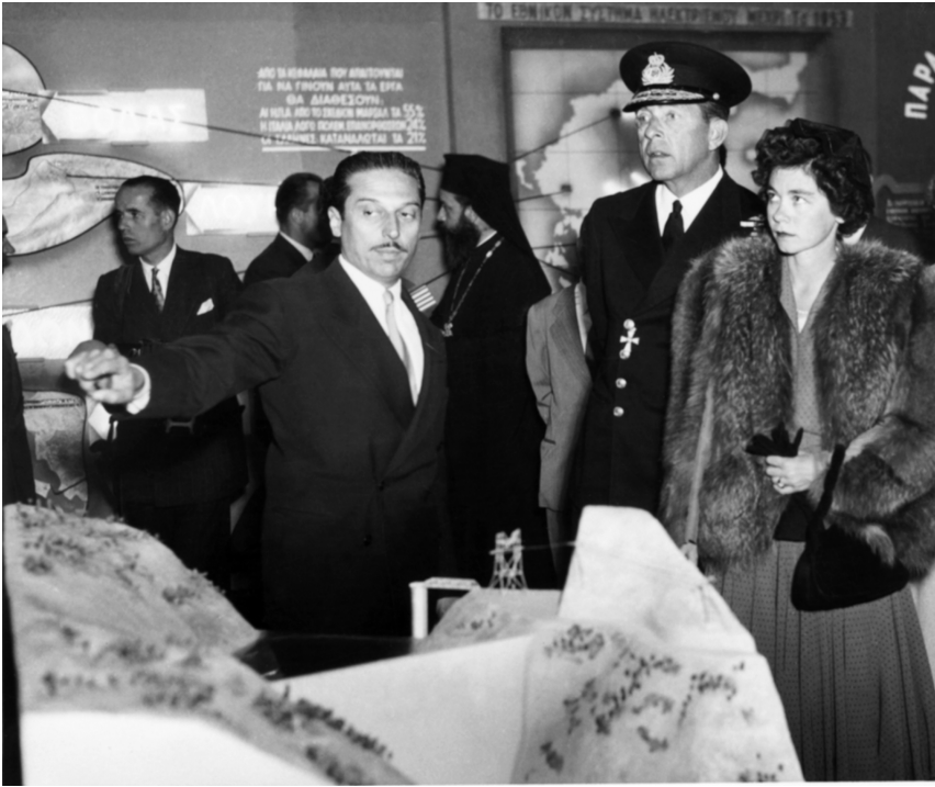
Fig. 4. Constantinos Doxiadis (left) in conversation with King Paul and Queen Frederica at the Athens opening of the “Electricity and Recovery” exhibition, 3 May 1950.

Coming from a man who devoted his life to human settlements, this bias in Doxiadis’ interpretation of development is hardly surprising. Writing in the ministry’s bulletin of 1949 on the relative importance of investment in housing, Doxiadis conceded that building factories, dams, ports and roads were noble causes, but: