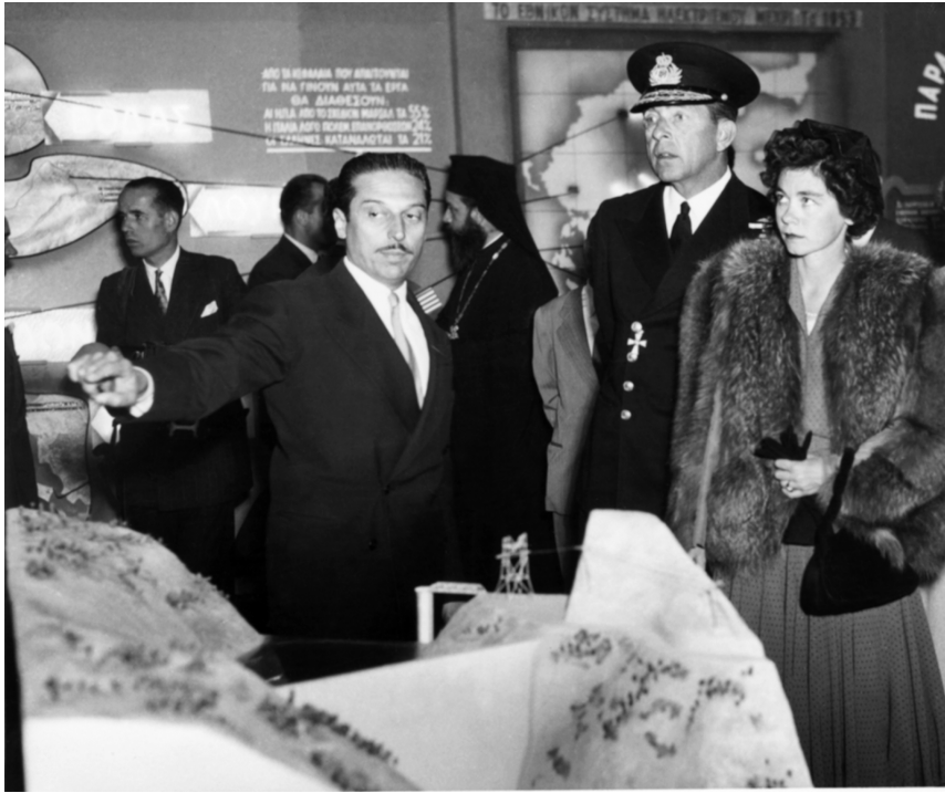
Fig. 4. Constantinos Doxiadis (left) in conversation with King Paul and Queen Frederica at the Athens opening of the “Electricity and Recovery” exhibition, 3 May 1950.

Coming from a man who devoted his life to human settlements, this bias in Doxiadis’ interpretation of development is hardly surprising. Writing in the ministry’s bulletin of 1949 on the relative importance of investment in housing, Doxiadis conceded that building factories, dams, ports and roads were noble causes, but: