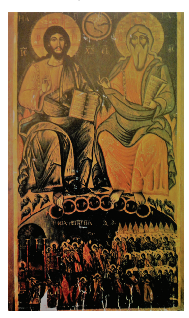
Fig. 11. Archbishop Moses, The Holy Trinity – Holy Liturgy, Museo Civico, Livorno.

For the interior decoration of the church, the Greek community first invited the Archbishop Moses from Crete. The two principal icons, of large dimensions, the Holy Trinity – Holy Liturgy (1761) and the enthroned Virgin and Child (1762), which are found today in the Museo Civico of the city, did not satisfy the aesthetic expectations of the Greeks of Livorno because of their linearity and conservative style (fig. 11), so the cooperation with Archbishop Moses came to an end.<sup>34</sup> A surviving reference