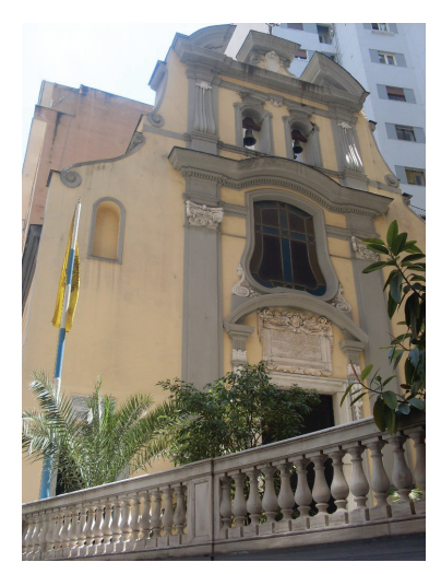
Fig. 5. Sts Peter and Paul, Naples.

niche was renovated by Sevastianos Santis in 1853 according to the model of the previous artistic style].<sup>18</sup>