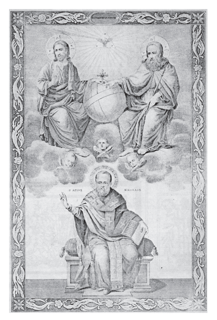
Fig. 16. Engraving of The Holy Trinity and St Nicholas by Ioannis Trygonis.

of the picture, the Holy Trinity with putti is borrowed from Italian painting, whereas below St Nicolas is represented according to Post-Byzantine patterns (fig. 16).