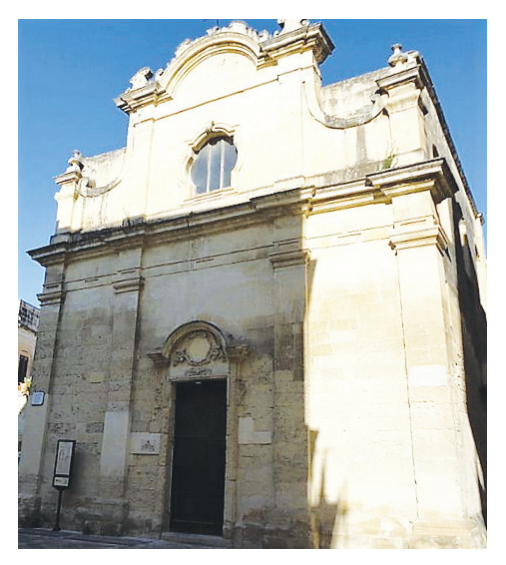
Fig. 7. St Nicholas of the Greeks, Lecce.