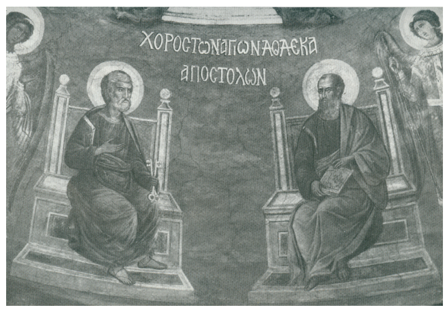
Fig. 3. The apostles painted by Ioannis Kyprios, 1590, St George of the Greeks, Venice.