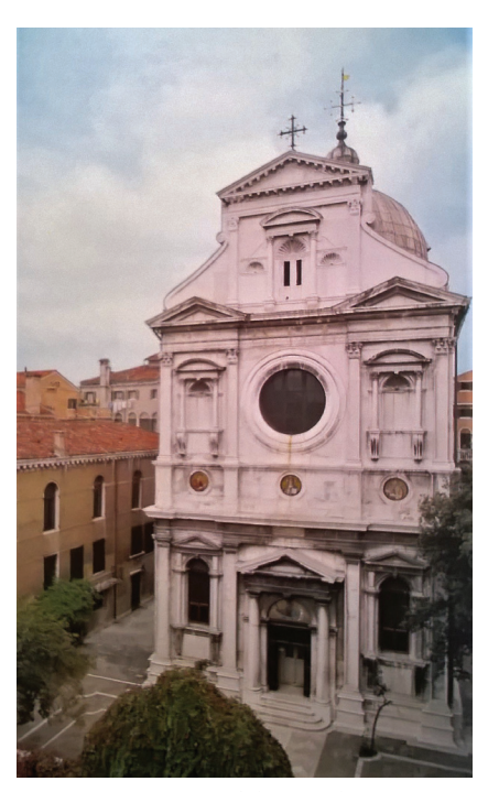
Fig. 2. St George of the Greeks, Venice.

tradition, as well as their will to introduce the "pittura greca" to the interior decoration of churches, were influenced and formed by the artistic environment of Italy. Beginning with Venice and, in particular, with the Late Renaissance church of St George of the Greeks (fig. 2),12 built by the famous Italian architect of Santa Maria della Salute, Baldassare Longhena,13 it is important to stress that from Naples to Trieste the choices of the architectural type and the exterior decoration of the churches - as we will see later - absolutely conformed to the contemporary dominant architectural style of the Italian cities. The choices of the painters and their art became an issue only with respect to the interior decoration, where the icons were directly associated with dogma and worship.