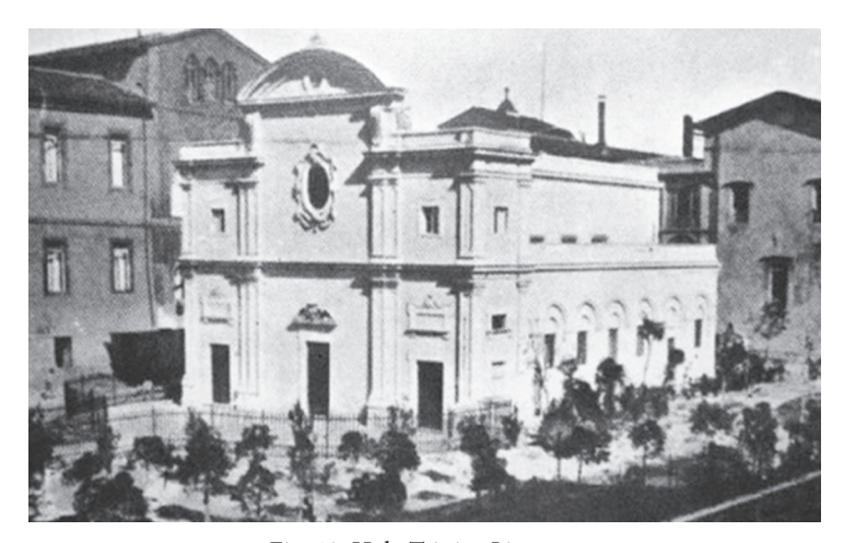
Fig. 10. Holy Trinity, Livorno.