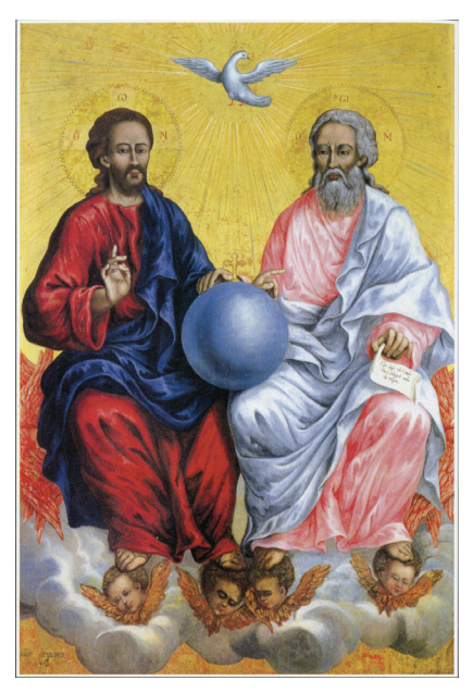
Fig. 12. Spyridon Romas, The Holy Trinity , Museo Civico, Livorno.

letter from Corfu dated 1762, now in the State Archives of the city, bears witness to the fact that the search for a capable painter continued; it introduces the painter Spyridon Romas from Corfu as a capable painter of "pittura romeica". This type of painting, the style of Spyridon Romas, is a significant sample of the art of the Ionian Islands, which had Byzantine influences, Renaissance naturalness and tranquillity, but also Baroque decorative tendencies (fig. 12). More than 20 icons were painted for the church of the Holy Trinity, as demonstrated by Romas' contract, which was renewed in 1764 and 1766.35