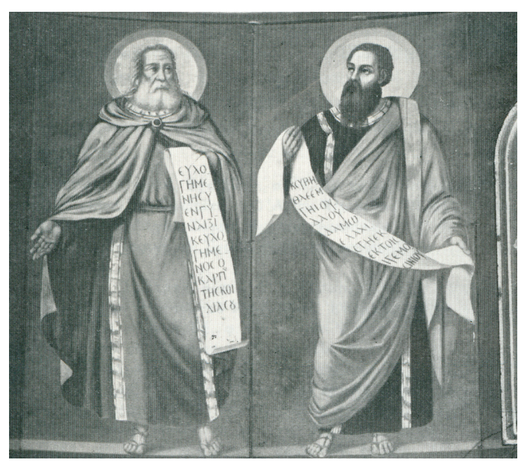
Fig. 4. The prophets repainted by Sebastiano Santi, 1853, St George of the Greeks, Venice.