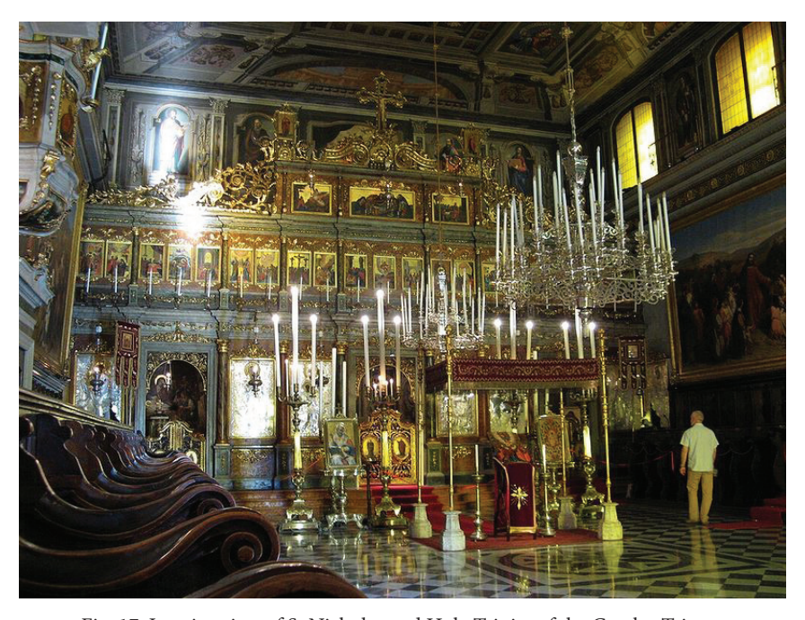
Fig. 17. Interior view of St Nicholas and Holy Trinity of the Greeks, Trieste.

If we take into consideration that the studies of the painter from Kefalonia in Italy and the transfer of his works to Corfu were carried out in very