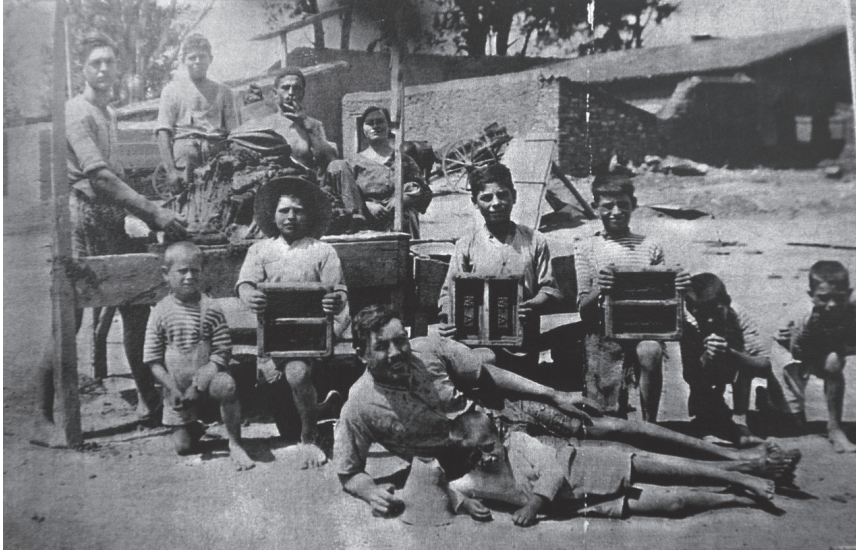
Fig. 1. Bouritis' brickworks, Orpheus Street, Elaionas, c. 1945–1950