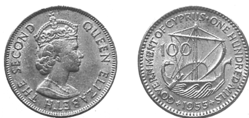
Fig. 19-20: Obverse and reverse of Queen Elizabeth II’s 100 mil cupro-nickel coin (1955).

The obverse, common to all the issues, was the work of Cecil Thomas and carries on its centre the crowned bust of Elizabeth II, and clockwise the