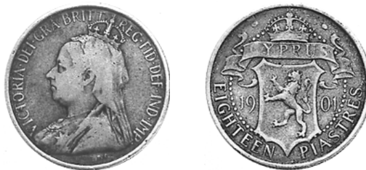
Fig. 5-6: Obverse and reverse of Queen Victoria's 18 piastre silver coin (1901).

The death of Queen Victoria and the accession of Edward VII in 1901, and subsequently the death of