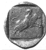
Fig. 37: Reverse of a silver stater of Marion.

or, worse, to disaster. Their symbols are swept away by the winds of History with the same swiftness that returned to nothingness the flags invented by the United States for Iraq or by the Annan plan for Cyprus. Harmonious coexistence cannot be founded