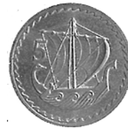
Fig. 34: Reverse of the Republic of Cyprus 5 mil copper coin (1982).

The lessons from this failed attempt to create an “authentic Cypriot”, one might say an Eteo-cypriot, conscience in Cyprus retain all their actuality 50 years later. It would indeed be vain to seek the solution to the political problems of the island through the erasure of the cultural identity of the communities forming its population.