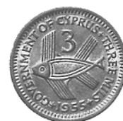
Fig. 24: Reverse of Queen Elizabeth II's 3 mil copper coin (1955).

The 25 mils reverse figures “a stylised bull’s head... that represents agriculture”. 39 A branch of a plant was added on the left of the head and the number 25 below it. Clockwise the legend reads GOVERNMENT OF CYPRUS+TWENTY FIVE MILS+1955+.