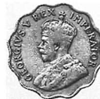
Fig. 14-15: Obverse and reverse of King George V's 1 piastre cupro-nickel coin (1934).

In 1926 the minting of copper \frac{1}{4} piastre coins was discontinued, and after 1931 the copper coins of 1 and of \frac{1}{2} a piastre met the same fate. Instead, in 1934 cupro-nickel coins of 1 and of \frac{1}{2} a piastre were struck, with a scalloped shape and a smaller diameter, with the same obverse; the