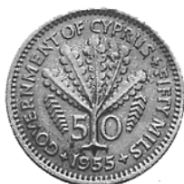
Fig. 21: Reverse of Queen Elizabeth II's 50 mil cupro-nickel coin (1955).

The 100 mils reverse figures “a sailing ship... that represents the island’s trade”. 37 The number 100 is engraved on the sail, and clockwise the legend reads GOVERNMENT OF CYPRUS+ONE HUNDRED MILS+(date: 1955 or 1957)+.