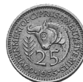
Fig. 22: Reverse of Queen Elizabeth II's 25 mil cupro-nickel coin (1955).

The 50 mils reverse displays “a ‘symbolic tree’... that represents forest wealth.” 38 The two digits of the number 50 are on either side of the trunk of the tree and clockwise one can read the legend GOVERNMENT OF CYPRUS+FIFTY MILS+1955+.