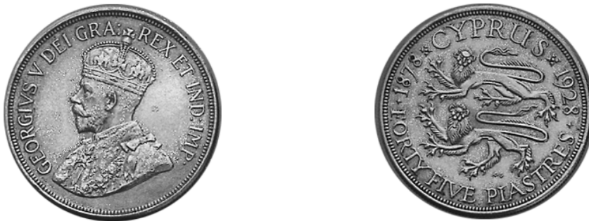
Fig. 12-13: Obverse and reverse of King George V's commemorative 45 piastre silver coin (1928).

In 1926 the minting of copper \frac{1}{4} piastre coins was discontinued, and after 1931 the copper coins of 1 and of \frac{1}{2} a piastre met the same fate. Instead, in 1934 cupro-nickel coins of 1 and of \frac{1}{2} a piastre were struck, with a scalloped shape and a smaller diameter, with the same obverse; the