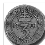
Fig. 3-4: Obverse and reverse of Queen Victoria’s 3 piastre silver coin (1901).

The coins of 4½, 9 and 18 piastres present the same obverse but a quite different reverse: within a beaded circle a shield decorated with a lion rampant and above it a scroll carrying the inscription CYPRUS crowned by the British crown, and on either side of the shield the date as on the 3 piastre coin. Outside the circle and