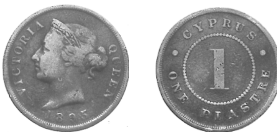
Fig. 1-2: Obverse and reverse of Queen Victoria's 1 piastre copper coin (1885).

The new copper coins, which were struck (1879-1901) in great quantities in England during the reign of Queen Victoria, were the work of the Chief Engraver of the Royal Mint in London, L. C. Wyon. The obverse figures the head of Victoria wearing a coronet ornamented with oak leaves and scrolls and carries the legend VICTORIA QUEEN and the date; the reverse carries the numbers 1, \frac{1}{2} and \frac{1}{4} respectively, within a beaded circle, and the legends CYPRUS and, according to the value of the coin, ONE PIASTRE, HALF PIASTRE or QUARTER PIASTRE.