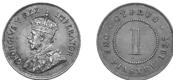
Fig. 7-8: Obverse and reverse of King George V's 1 piastre copper coin (1927).

that king and the accession of George V in 1910 consolidated the Cypriot coinage's new orientation. The reverse of the copper coinage, with the exception of the date, remains the same, but on the obverse the crowned bust of the king with coronation regalia is introduced, as well as the developed titles in Latin, EDWARDVS VII REX IMPERATOR and GEORGIVS V REX IMPERATOR, respectively. The obverse of the coins of Edward VII was again the work of de Saulles, while Edgar Bertram MacKennal was responsible for those of George V. The reverse of the silver coinage, which, like the copper one, was minted to the same standard, also remained identical, with the exception of the date. However, the