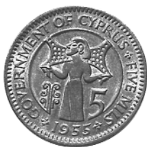
Fig. 23: Reverse of Queen Elizabeth II's 5 mil copper coin (1955).

The 50 mils reverse displays “a ‘symbolic tree’... that represents forest wealth.” 38 The two digits of the number 50 are on either side of the trunk of the tree and clockwise one can read the legend GOVERNMENT OF CYPRUS+FIFTY MILS+1955+.