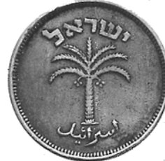
Fig. 29: Obverse of Israel's 100 mil cupro-nickel coin (1949).

Lusignans or to the Plantagenets 42 by an iconography evoking the past of the inhabitants of the island. Even the expression "Government of Cyprus" instead of the simple "Cyprus" might suggest that the colonial government somehow belonged to Cyprus. Nevertheless, the choice of the above subjects is neither random nor neutral. Although all find their inspiration in antiquity, practically none of them recalls its Greek character. Three out of five (50, 5 and 3 mil coins) figure items from the Bronze Age or the first period of the Iron Age: according to Pridmore, a not otherwise specified "Mycenaean ivory found at Enkomi" (50 mils), 43 "a bronze panel found at Curium" (5 mils) 44 and "a design of an iron-age vase in the Cyprus Museum" (3 mils). 45 Only a trained archaeologist might recognise in them