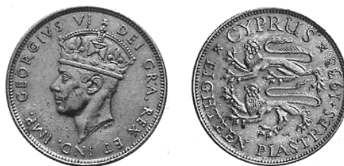
Fig. 16-17: Obverse and reverse of King George VI's 18 piastre silver coin (1938).

piastres with the indication of the value in full text: + CYPRUS + EIGHTEEN PIASTRES*1938 (or 1940), +CYPRUS+NINE PIASTRES* 1938 (or 1940), and +CYPRUS+ FOUR AND A HALF PIASTRES* 1938, and on the obverse, designed by Percy Metcalfe, the crowned head of