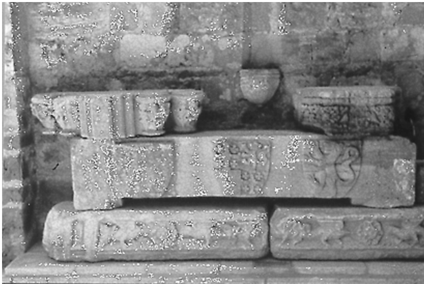
Fig. 9: Modern British coat of arms.