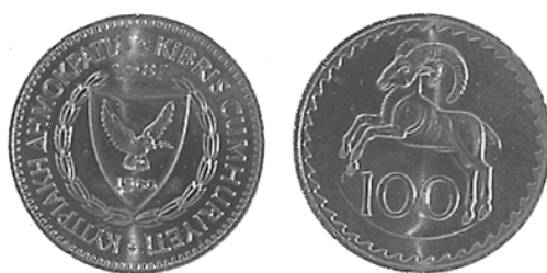
Fig. 30-31: Obverse and reverse of the Republic of Cyprus 100 mil cupro-nickel coin (1982).

grapes for the 50 mil, a cedar cone for the 25 mil, the same ancient sailing ship for the 5 mil coin and two ears of corn