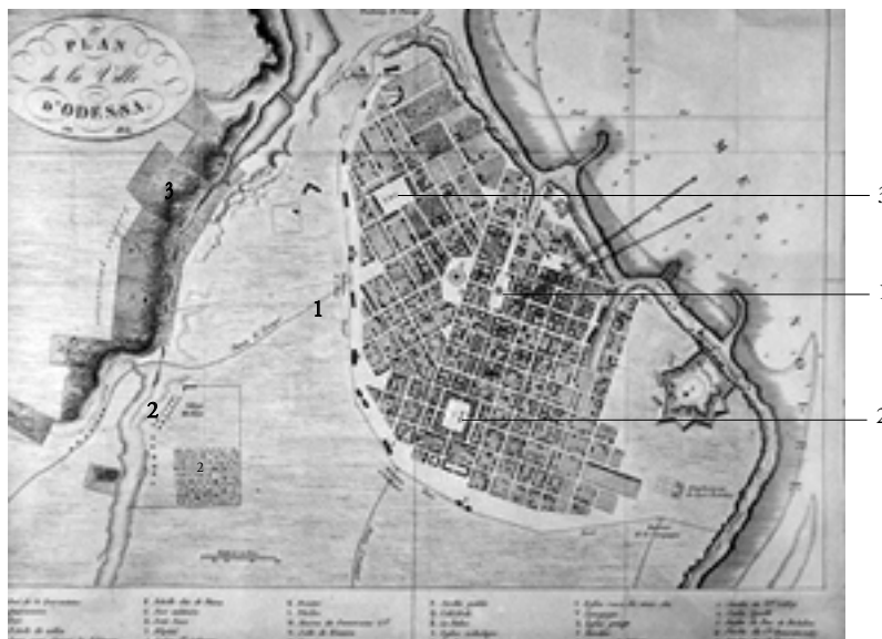
Plan of Odessa in 1814.