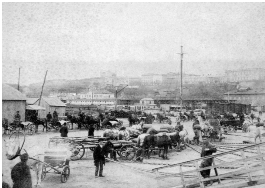
Grain transported to the Odessa port.

“rocked the boat in the market” because they continued buying even when prices ascended, in contrast to the Greeks, who had orders from their houses to stop buying and wait for prices to fall again. 18