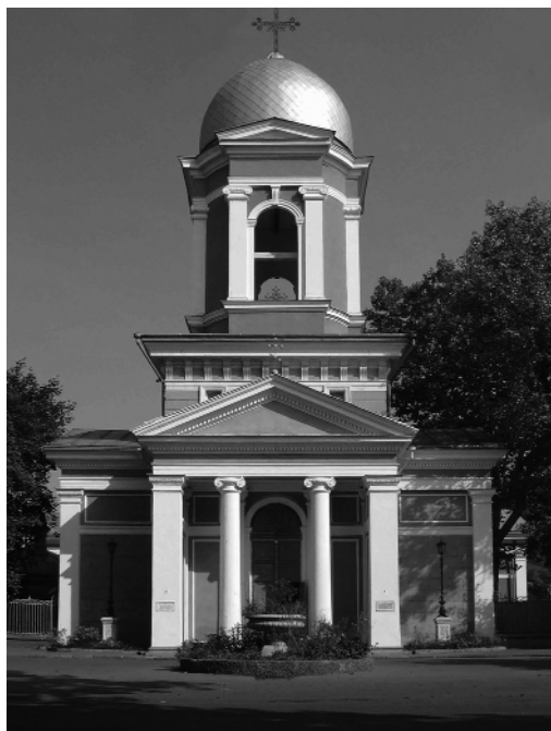
The Church of the Holy Trinity, Odessa, scene of the 1871 conflict.

clothes and iron shops, crockery, glass and leather workshops, brokers' and bankers' offices, as well as private houses that belonged to Jews. Their contents were pillaged and thrown into the streets. The police authorities proved unable to restore order for more than three days and finally managed to do so with military intervention.