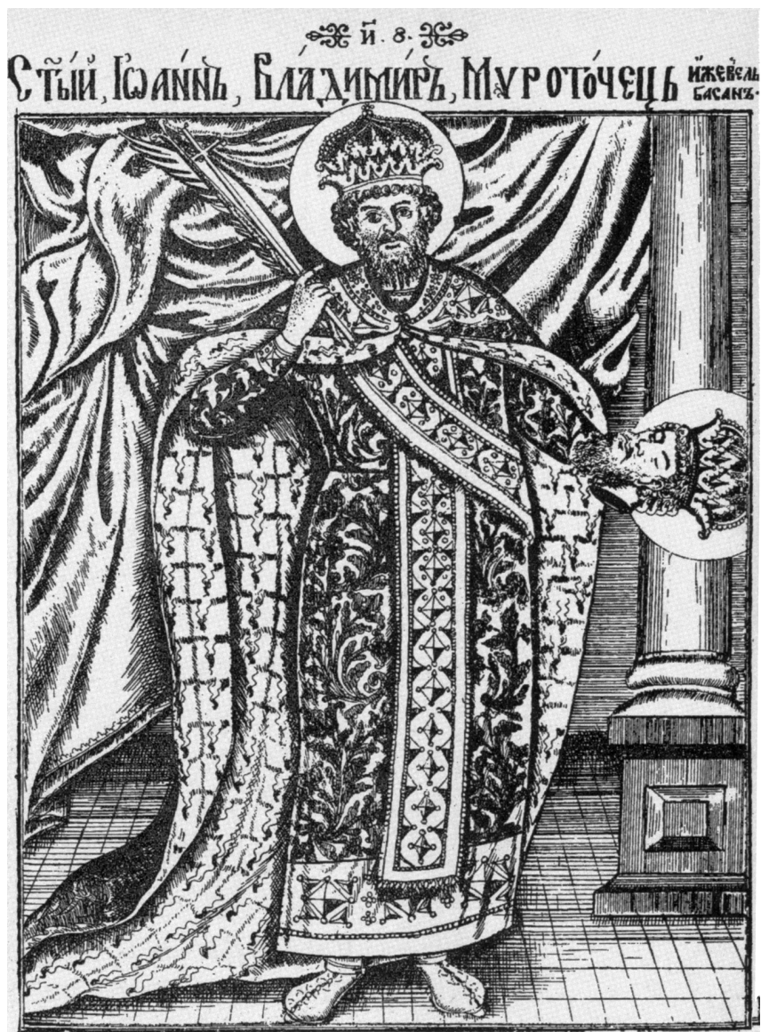
Fig. 5. Engraving of St John Vladimir in the Stemmatoграфия (Venice 1741).