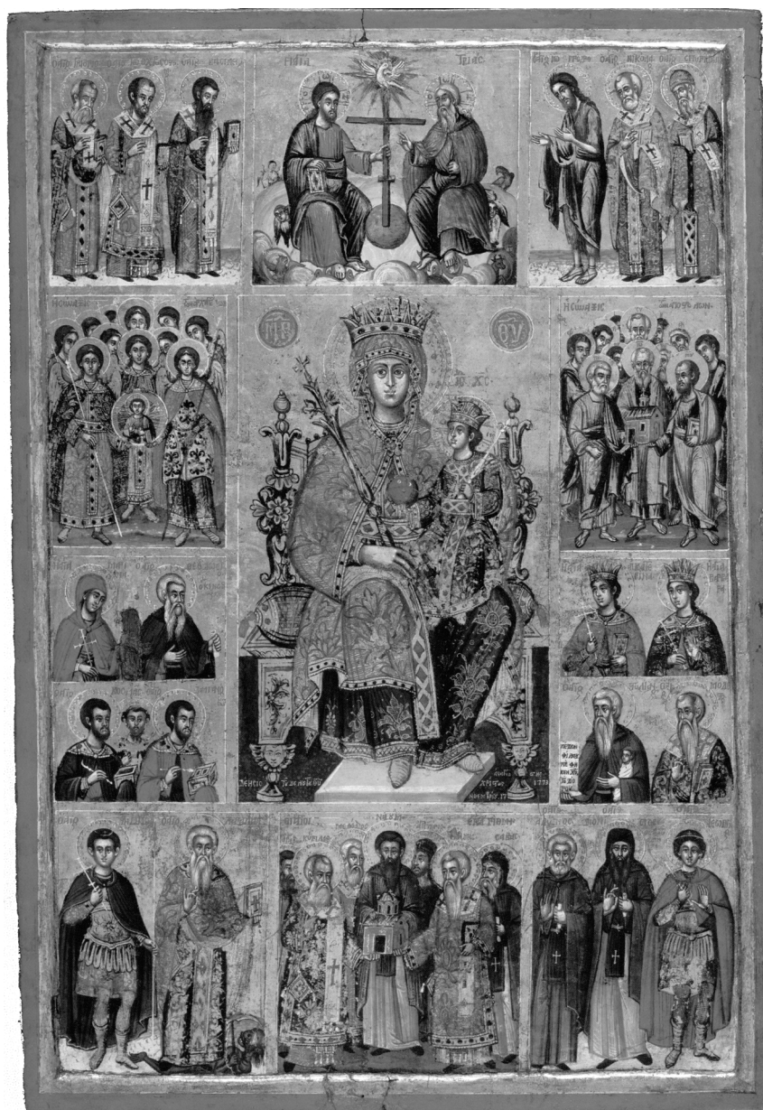
Fig. 6. The Virgin of the Unfading Rose with scenes and saints, 1773, Collection of the National Museum of Medieval Art, Korčë.