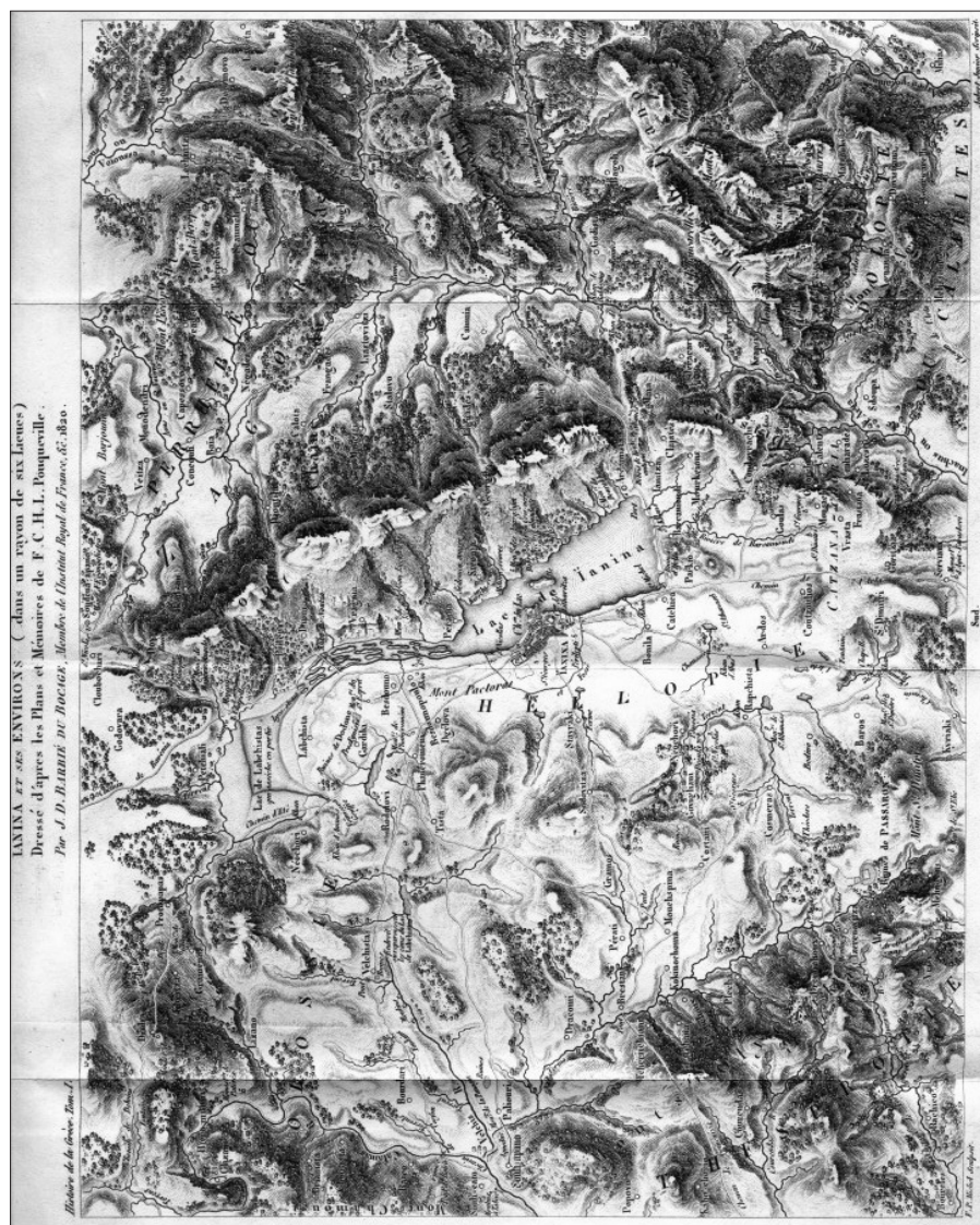
Fig. 1. "Ianina et ses environs", in F.-C.-H.-L. Pouqueville, Histoire de la régénération de la Grèce, comprenant le précis des évènements depuis 1740 jusqu'en 1824 , 2nd edition, Vol. I, Paris: chez Firmin Didot Père et Fils, 1825.