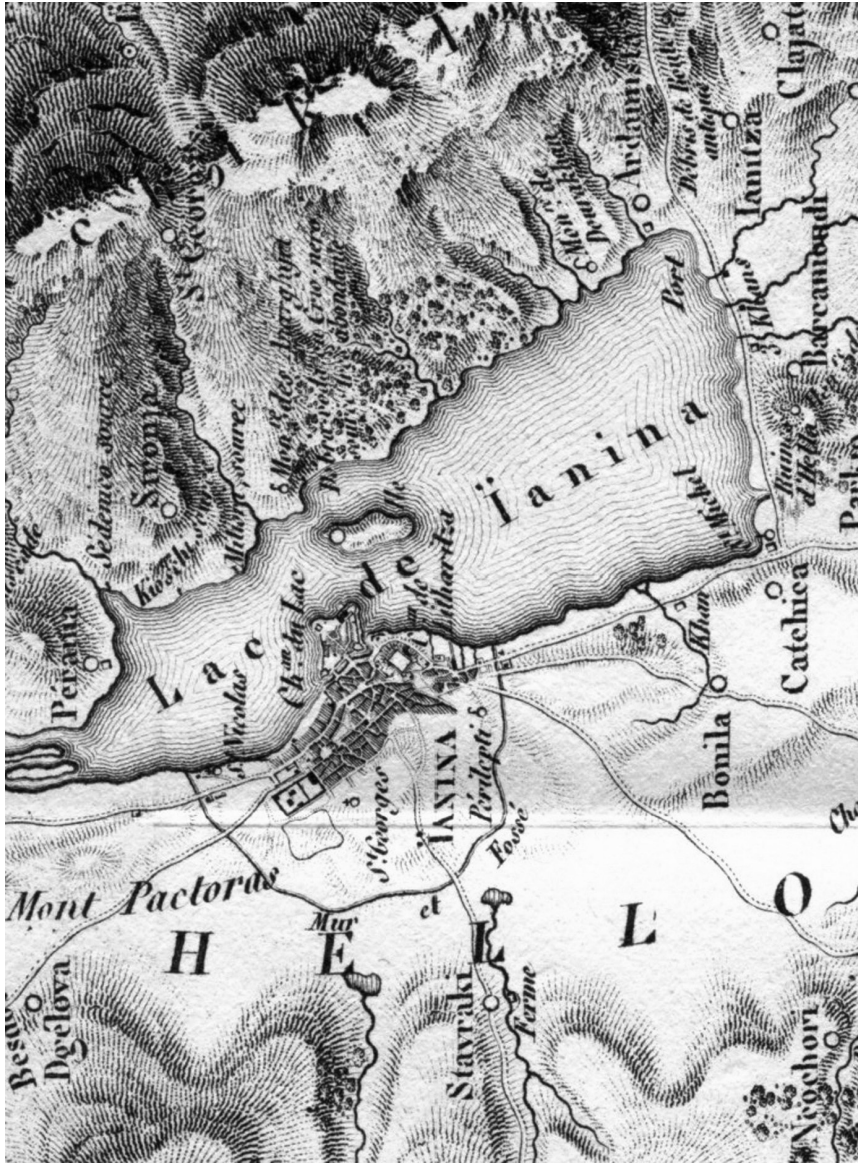
Fig. 2. “Tanina et ses environs” [closer view of city and lake], in Pouqueville, Histoire .