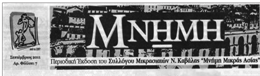
Fig. 2. The banner of the Society of South Kavala's periodical, Μνήμη. Μνήμη Μικράς Ασίας, μνήμες Καταστροφής [Memory: memory of Asia Minor, memories of Catastrophe] (September 2011).

Thanks to these efforts, there emerged a voluminous literature around the issues of the Asia Minor Catastrophe, the Exodus and refugeehood. 84 For instance, the first issue of the Μικρασιατικά Χρονικά starts with a preface entitled "Greek culture in Asia Minor". 85 The article's first paragraph summarizes the importance of the political changes in Asia Minor after August 1922 for the countries of the Eastern Mediterranean, particularly Greece and Turkey, and for Hellenism rooted in Asia Minor for more than 3 millennia. Then the author drew a full circle by first recounting the long history of Hellenism in Asia Minor and then returning to the 1922 Catastrophe at the end of the text. The author almost seems to recount this cyclical history in order to trap the reader within the tragedy of Asia Minor Hellenism and to prove the importance of "preserving and researching the relics of Asia Minor". 86