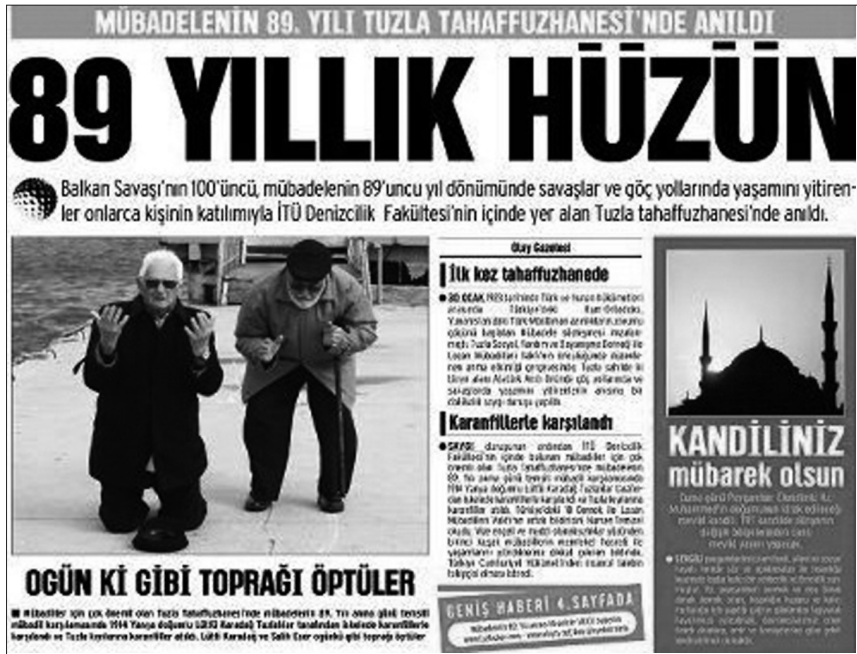
Fig. 5. Ceremony organized by the Association of Lausanne Treaty Emigrants. Two first-generation exchangees kissed the ground at the port of their arrival in Turkey. The caption reads “89 years of grief”.

and talks. The most significant of the nostalgic events in Turkey, however, is the ceremony that the Association of Lausanne Treaty Emigrants organizes annually on 30 January, the anniversary of the signing of the Exchange Convention (see fig. 5). A few first-generation exchangees, who are more than 90 years old and still healthy enough to participate, with their descendants and other second- and third-generation exchangees gather at the port of Tuzla, Istanbul, to offer carnations to the sea and to commemorate the exchange.