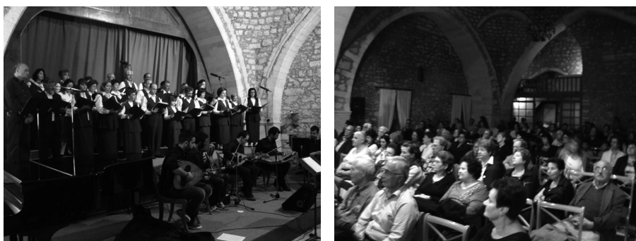
Figs 3-4. From the commemoration event organized by the Asia Minor Association in Rethymnon, 25 May 2011.

of Constantinople; 90 the event was held at the city's cultural center, located in Asia Minor Square. The poems and the talks, including the one by the Metropolitan Bishop of Rethymnon, were about the Fall of the City in 1453, whilst all of the songs were from Asia Minor, particularly from Smyrna, where most of the refugees resettled in this city came from: hence the night was dedicated to the commemoration of these two great losses – the Fall of Constantinople to the “Turks” and the end of Hellenism in Asia Minor (see figs 3-4). 91