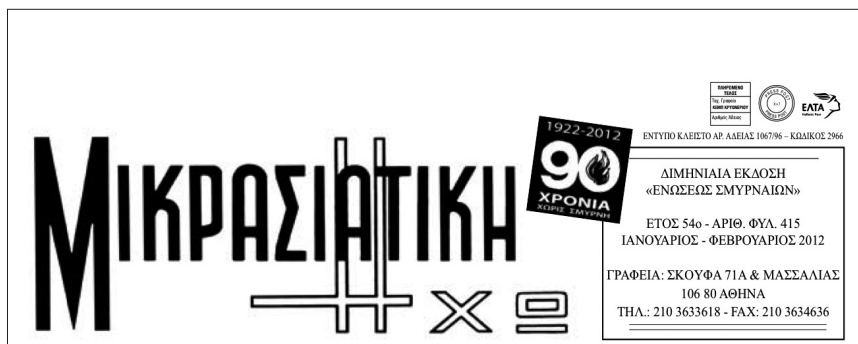
Fig. 1. The banner of the Union of Smyrniots' publication, Μικρασιατική Ηχώ [Asia Minor Echo] (January-February 2012).

While a distinct refugee identity and discourse was forming, the emphasis on expulsion became the marker of this identity and an integral part of the “refugee ideology”. How did this happen? After the Catastrophe, the refugees’ integration into the existing sociopolitical order took time, and the Greek state’s initiative alone was not enough to help this process in relative and absolute terms in the face of the problems created by the huge influx of refugees. As shown in the previous section, the refugees’ internalization of the host society’s beliefs, relating to issues such as their integration into the master narrative that was taught in schools, was belated. In this atmosphere, the refugees proactively took steps to integrate themselves into mainstream society by organizing associations, commissions and centers (for example, the Commission of Pontic Studies [1927] and the Union of Smyrniots [1936]), and by publishing newspapers ( Εφημερίς των Προσφύγων [Newspaper of refugees; 1923], Παμπροσφυγική [Pan-refugee; 1924], Προσφυγική Φωνή [Refugee voice; 1924], Προσφυγικός Κόσμος [Refugee world; 1927]) and periodicals Θρακικά [Thracian; 1928], Αρχαίον Πόντου [Archives of Pontos; 1928], Μικρασιατικά Χρονικά [Asia Minor chronicles; 1936], Μικρασιατική Εστία [Hearth of Asia Minor; 1946], Ποντιακή Εστία [Hearth of Pontos; 1950]). 80 Even though refugees did not found it, I should also mention the