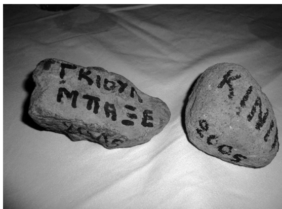
Fig. 8. The two stones that the interviewee brought from his parents’ hometowns in Turkey in 2005.

2005” [Gülbahçe] and on the other “KINIK – 2005” [Kınık]. Gülbahçe was his mother’s village, and Kınık his father’s. He introduced these rocks to us as his “father and mother” (see fig. 8). While not your usual historical sources, for him these rocks are tangible, living proof of his connection to a lost, ancestral homeland. His longing for his parents and their villages is so intricate that it is impossible to untangle the story from the stones. His nostalgia was deeply rooted in a place where he had never lived, and these two pieces of stone were the most concrete means at his disposal to share his parents’ refugee identity with his children and grandchildren.