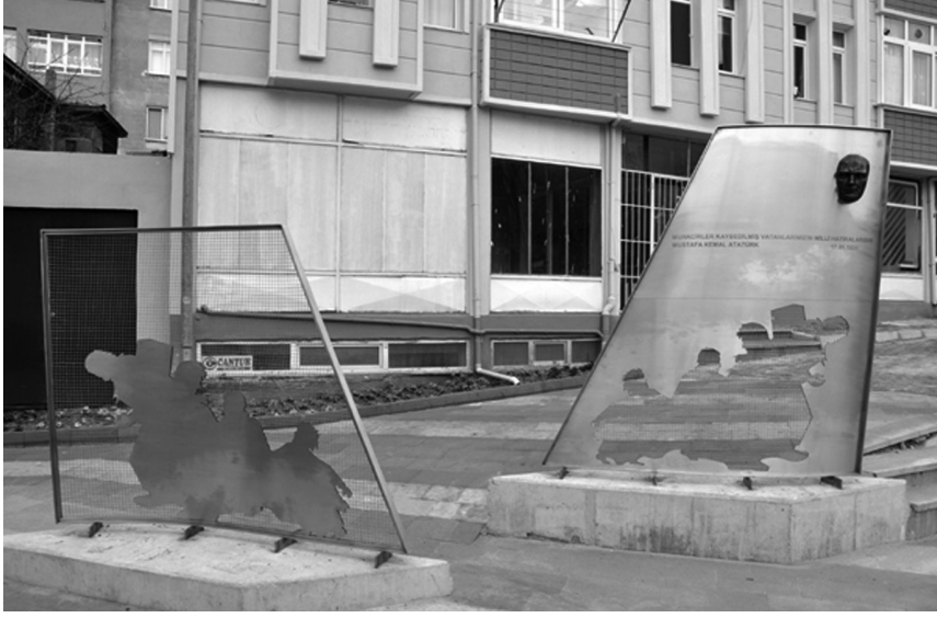
Fig. 7. The memorial in Population Exchange Square in Çatalca, Istanbul.

In 2010, for the first time in Turkey a memorial of the population exchange was built in a square in Çatalca, a district of Istanbul where Greeks and Muslims used to live together (see fig. 7). In the same square an abandoned Greek tavern was renovated and transformed into a museum dedicated to the population exchange, partly sponsored by the Foundation of Lausanne Treaty Emigrants. 95