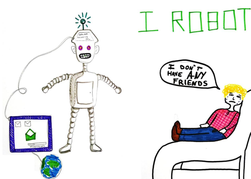
Figure 1. Psychotherapy in the era of artificial ultra-Intelligence and Panopticon: client's session uploading for big data processing 3