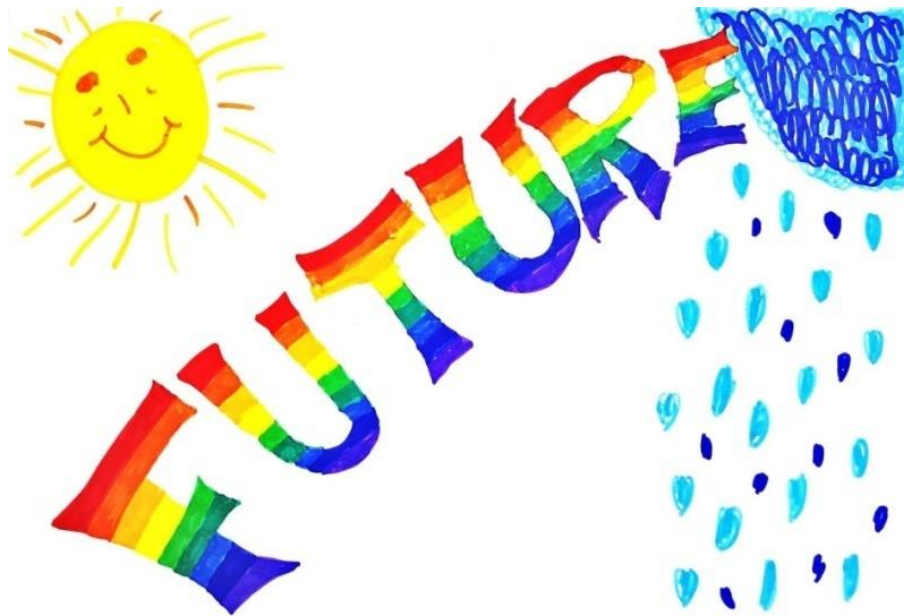
Figure 3. The implications of technology for human life is a complex phenomenon. We cannot know how the future will be. So we made it colorful. You never know how it's going to be at the end. So we draw a 'dark' side along with a 'sunny' side, and the colorful word 'future' connecting those two possibilities 13

no need to leave home because we will be able to consult our virtual doctor from home? Or maybe we'll have robot partners conditioned to say 'I love you', cook food and much more?" 12