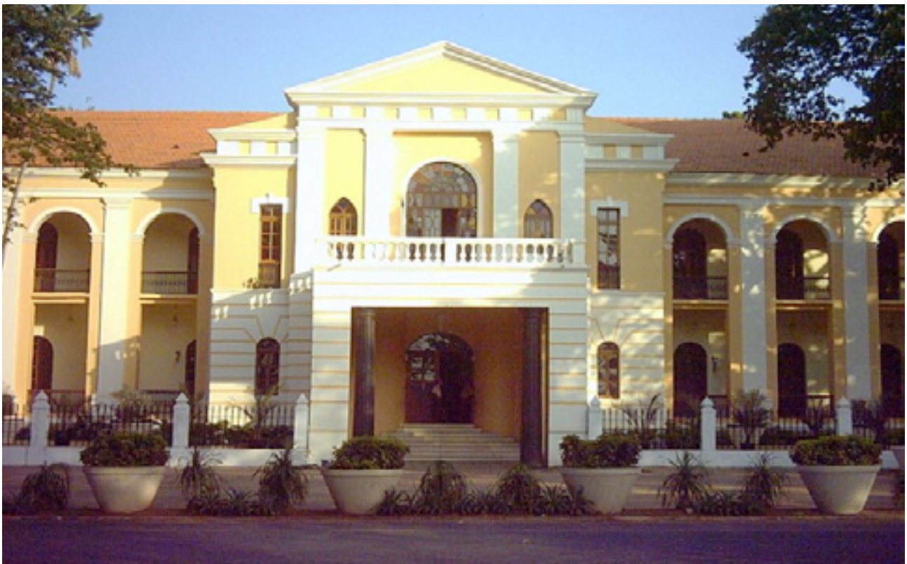
Figure 1. Picture of Escola Medico Cirurgica Da Goa, established under Portuguese in 1942, at Marquinez palace, Panaji 2

Paediatric cardiac surgery program was started in September 2014. We started calling a visiting paediatric cardiac surgery consultant, - who used