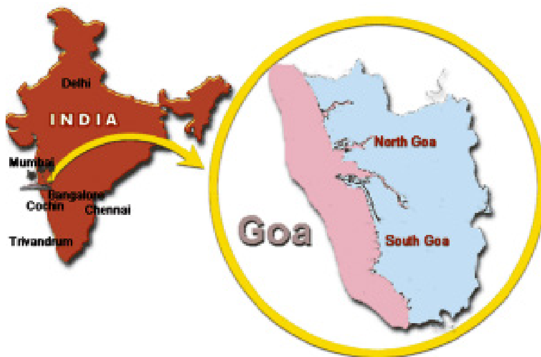
Figure 3. Map of India showing the location of the western state of Goa and its relationship with the adjacent states 3

Our team has also grown during this period. We have appointed one more junior consultant cardiac surgeon, two consultant cardiac anaesthesiologists, six new cardiologists, three more clinical perfusionists and more nursing staff in the operation theatre and ICU. All the team members with the support staffs work round the clock to provide comprehensive care and support in the peri-operative period.