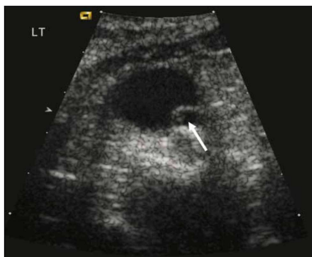
Figure 4. Four-month-old Labrador Retriever. Transverse sonogram of the urinary bladder at the area of the trigone. The left ureter (arrow) appears dilated and not terminating in this area. The left ureter continued caudally and terminated in the cranial part of the urethra.

The results of this study confirm previously published results (Fossum 1997, Lamb 1998) that