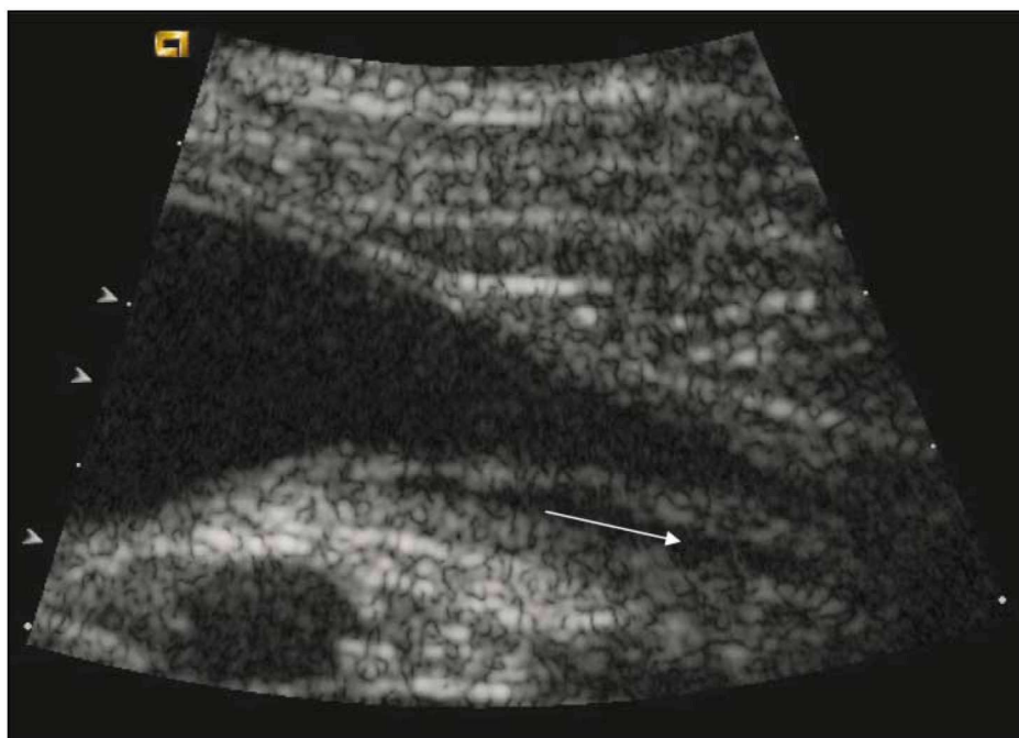
Figure 3. Oblique parasagittal image of the area of the bladder trigone and urethra of a 2-year-old Labrador Retriever. The right ureter (arrow follows ureteral lumen) appears to continue caudal to the bladder trigone.

The ureteral endings of 2 dogs could not be identified conclusively. IVU allowed correct identification of the ureteral termination in 2 of 5 dogs from the negative group (specificity 40%). No conclusion was reached in 3 control dogs. Overall, 19 of 24 dogs were diagnosed correctly (accuracy 75%).